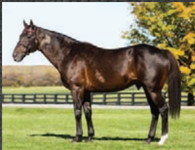
SILENT NAME BY SUNDAY SILENCE $7,500