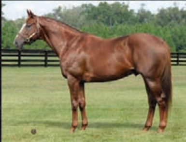
GIANT GIZMO BY GIANT'S CAUSEWAY $5,000