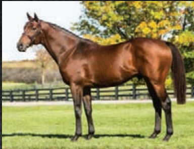
MAST TRACK BY MIZZEN MAST PRIVATE