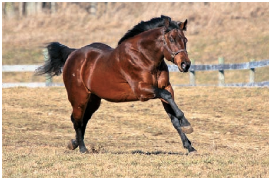
RichWine stallion Charging Indian

"Particularly after he sired the 2-year-old colt of the year, this season should be