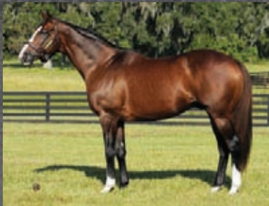
SLIGO BAY BY SADLER'S WELLS $5,000