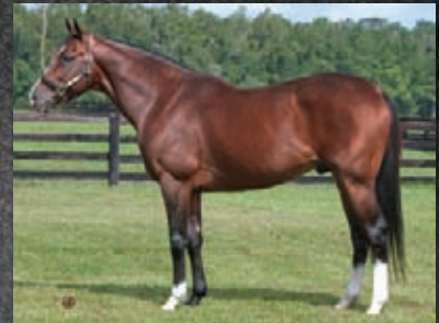
SINGING SAINT BY EL PRADO $2,500