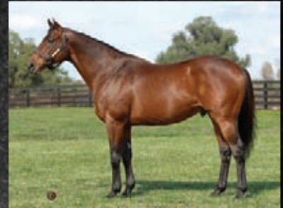
MILWAUKEE BREW BY WILD AGAIN $7,500