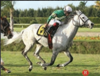
MUSKETIER BY ACATENANGO PRIVATE