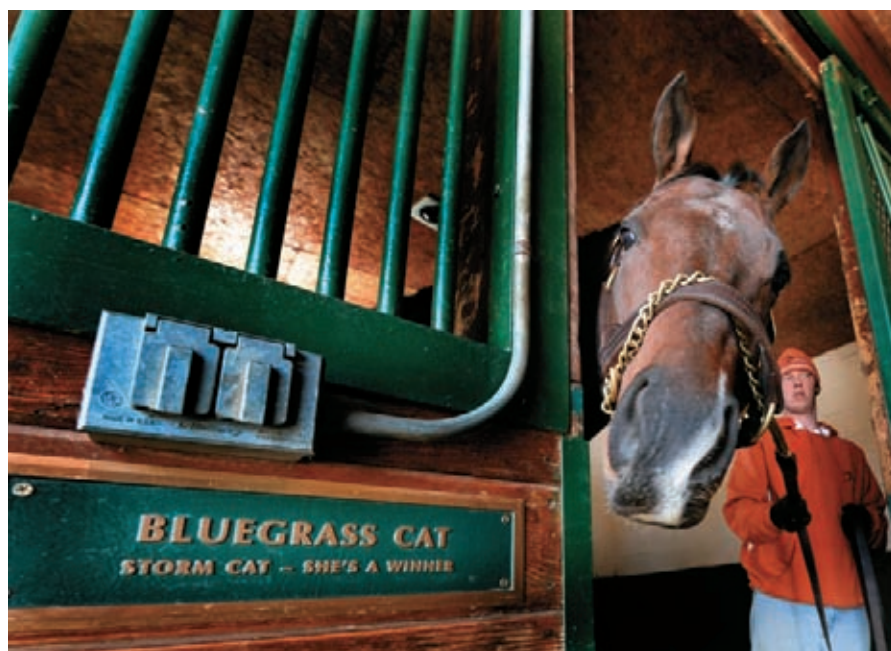
Bluegrass Cat was New York's leading sire in 2013

Certainly Visagie's familiarity with the