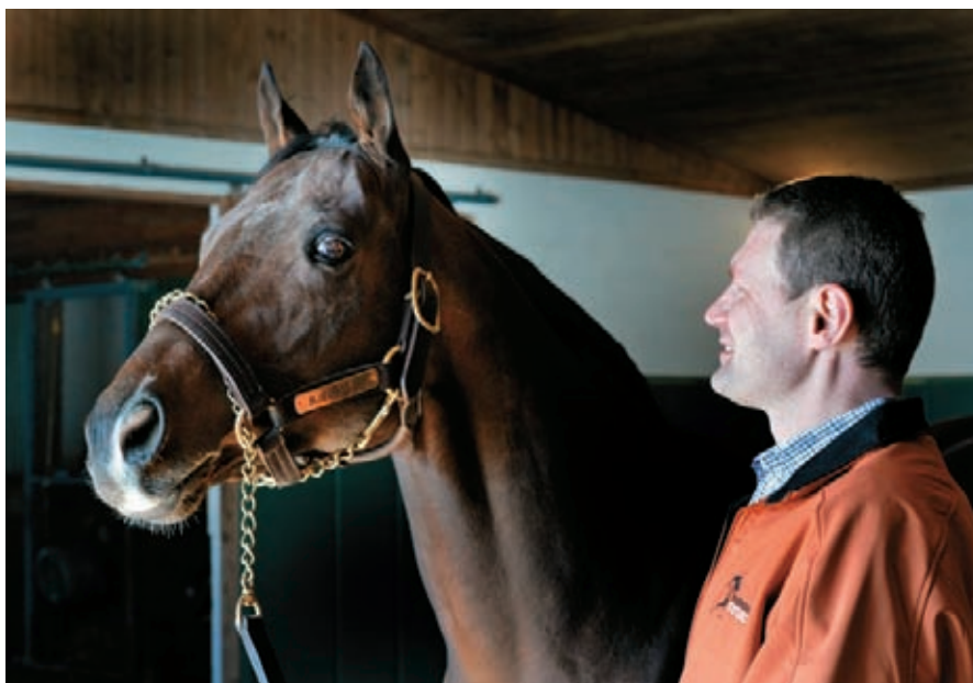
Visagie with Bluegrass Cat

"Although it's a booming market with good stallion prospects, the number of mares hasn't yet followed the number of stallions," said Erin Robinson, who sells