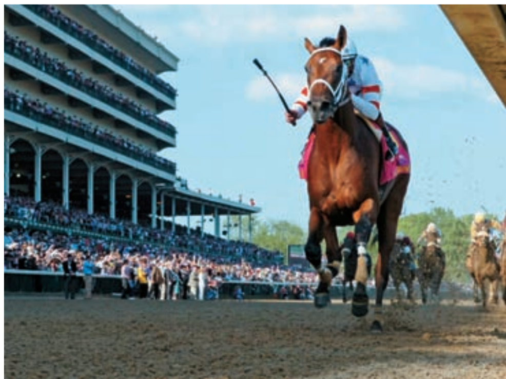
Big Brown wins the 2008 Kentucky Derby