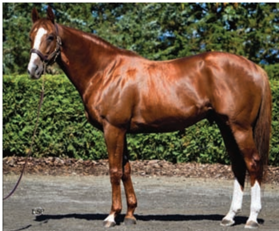
Frost Giant covered 139 mares last year at Keane Stud