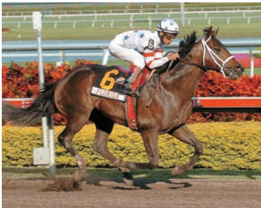
Cohen co-owned champion sprinter Benny the Bull

"He's a well-behaved horse who (continued on page 42)