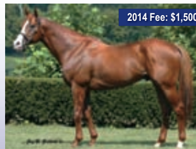
2014 Fee: $1,500 LF

Bittel Road • Civilisation Country Only • Garnered Global Force • Thirsty Giant Vinemeister