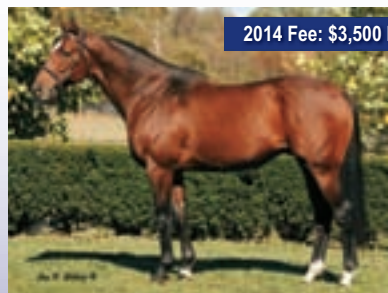
2014 Fee: $3,500 LF