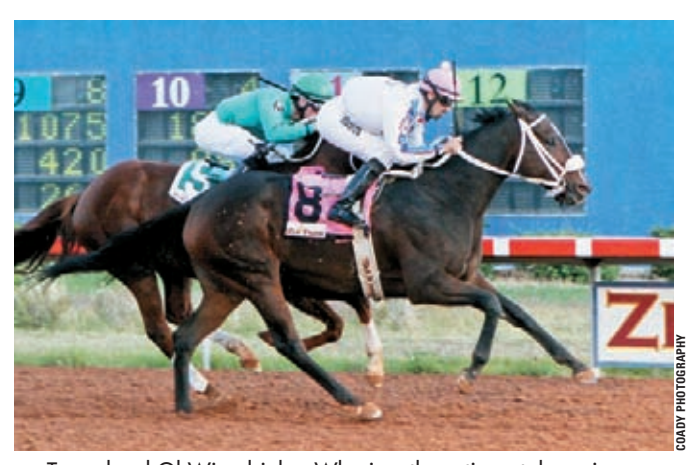
Texas-bred Ol Winedrinker Who is a three-time stakes winner