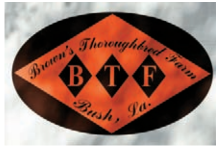
The farm's colors have brightened in the years since Hurricane Katrina