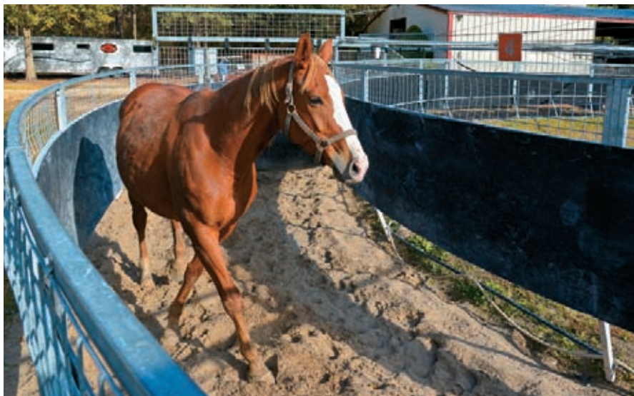
Getting a little exercise in the Browns' Eurocizer

ther snuck him under the turnstiles at the general admission gate at Fair Grounds.