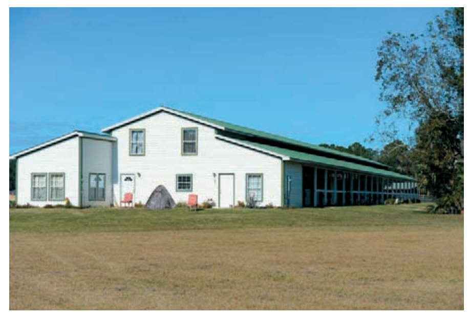
The Bouttes have 35 acres in The Gallops equine complex near Reddick, Fla.

With seven children and 10 grandchildren between them (second marriage for both), the Bouttes are dedicated to their