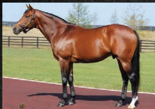
NORTH LIGHT (IRE)

GIANT'S CAUSEWAY – GOLDEN ANTIGUA, by HANSEL The Leading 2nd Crop Sire in Canada; 14% Stakes Horses incl two-time SW 2yo BROOKLYNSWAY $5,000 LFSN CANADIAN FUNDS