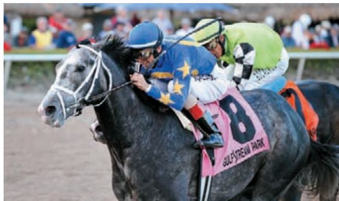
Liam's Map, a son of Miss Macy Sue, winning the Harlan's Holiday Stakes in December