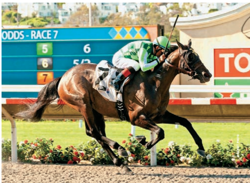
Sunset Glow winning the grade II Sorrento Stakes at Del Mar in August 2014