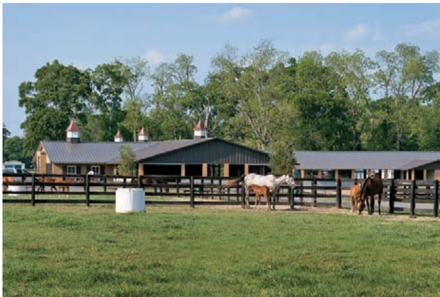
A full-service operation, Copper Crowne delivered 67 foals in 2014