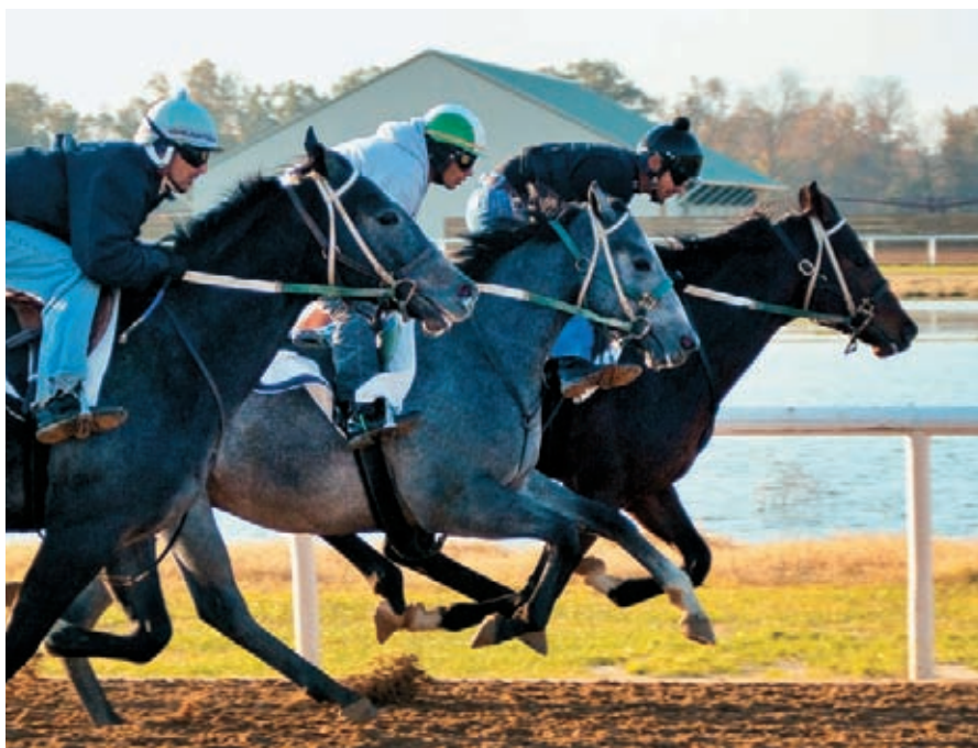
Horses gallop over Copper Crowne's 6½-furlong training track