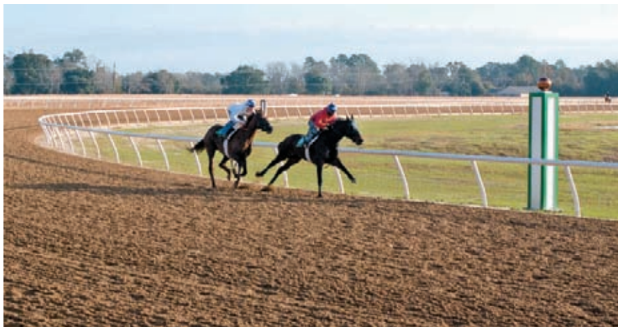
The training track is sanctioned by the state racing commission for official workouts

In 2014, 10 2-year-olds by Songandaprayer sold at auction for an average $34,700. He had 20 yearlings sell last year for an average of $19,265. These represent