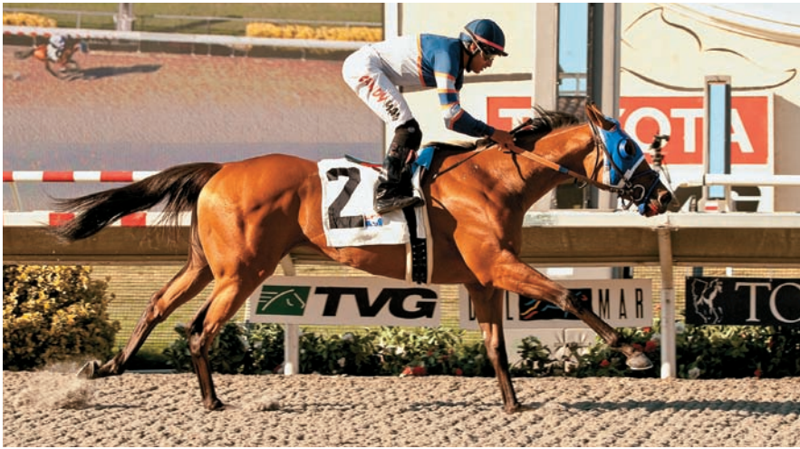
Sunday Rules, winning the Generous Portion Stakes at Del Mar in 2013