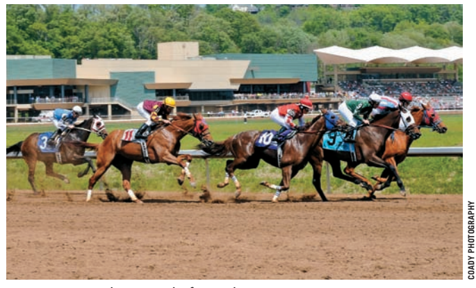
Racing at Belterra Park, formerly River Downs, near Cincinnati