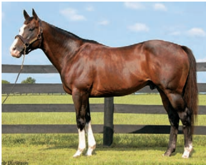
Freud, New York's leading sire of 2014