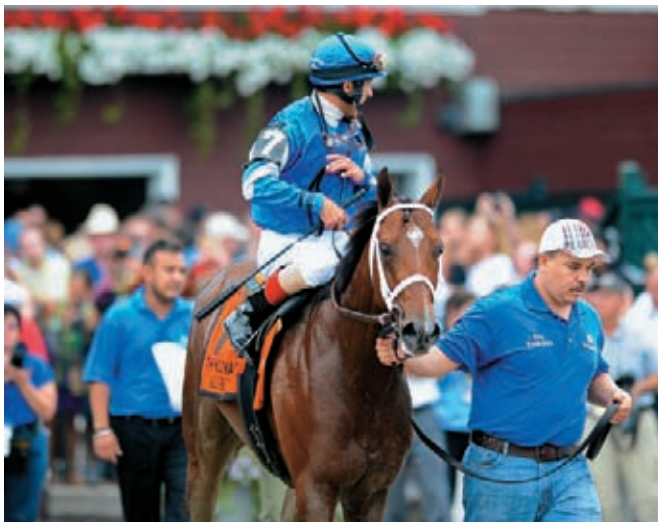
Alpha makes his stallion debut in New York this year