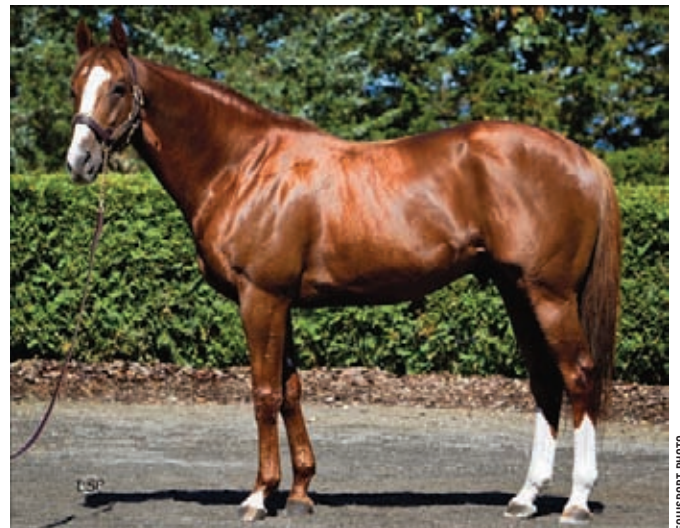
Grade I winner Frost Giant stands at Keane Stud