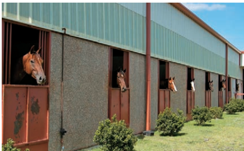
River Oaks offers breaking and training along with year-round mare care

eight-stall stallion barn that has an indoor wash rack, storage area, and my office. Then we built a mare barn with 35 stalls. We continue to build paddocks of different sizes so we can offer private mare and baby care, or put groups of two, four, or 10 mares together. We offer breaking and training, year-round mare care, baby care, yearling care, and breeding. We have a five-eighths-mile dirt track built by an engineering company from Texas. We