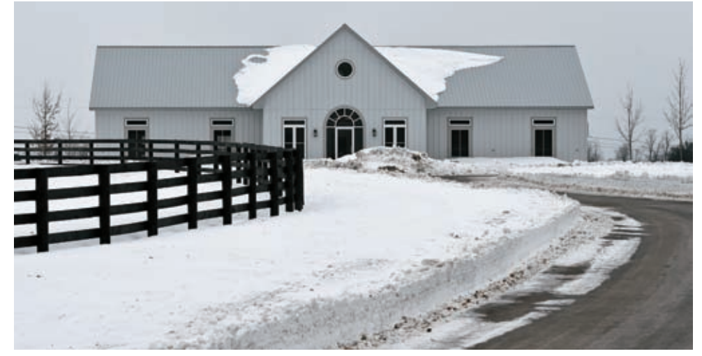
The stallion barn at Sequel New York