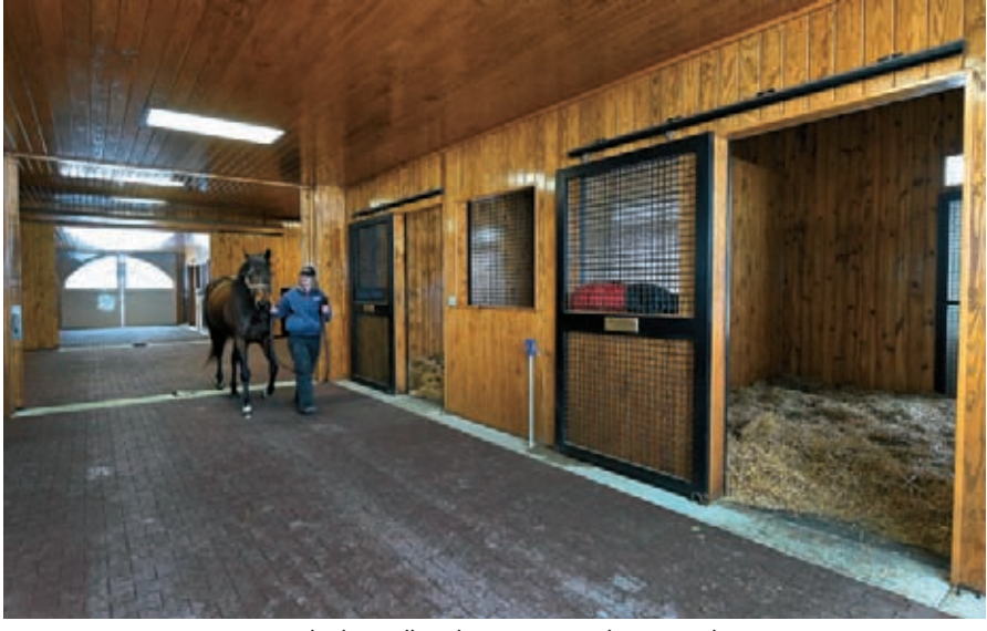
Inside the stallion barn at Sequel New York

graded stakes in 2012, winning the grade III Withers Stakes, grade II Jim Dandy Stakes, and dead-heating for the victory in the grade I Travers Stakes. For good measure, in 2013 he added the Woodward Stakes (gr. I).