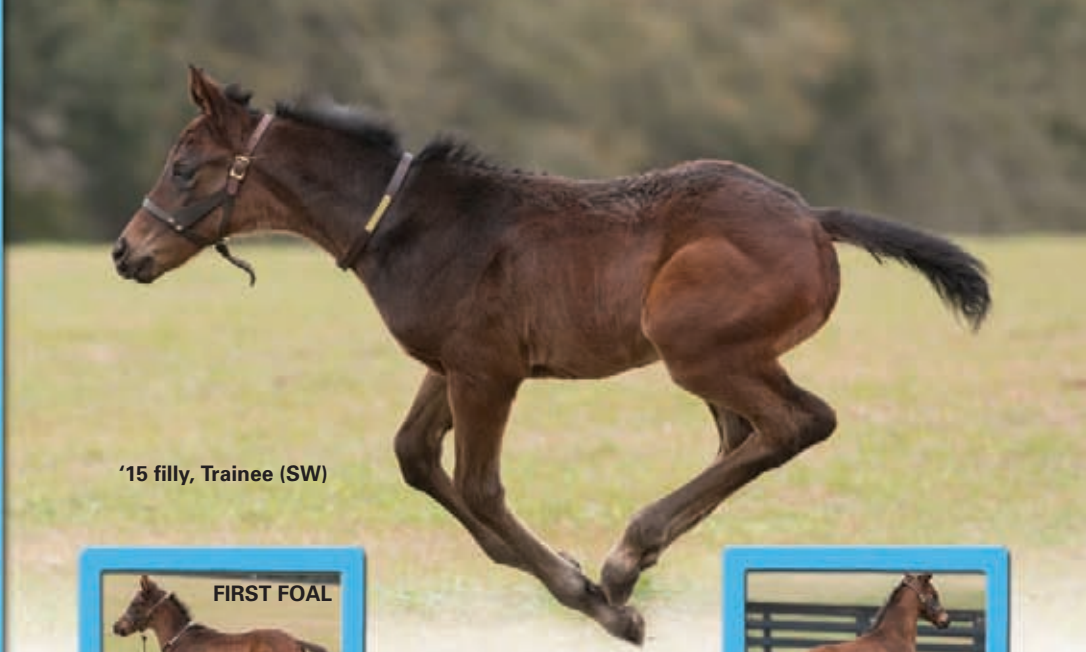
'15 filly, Trainee (SW)