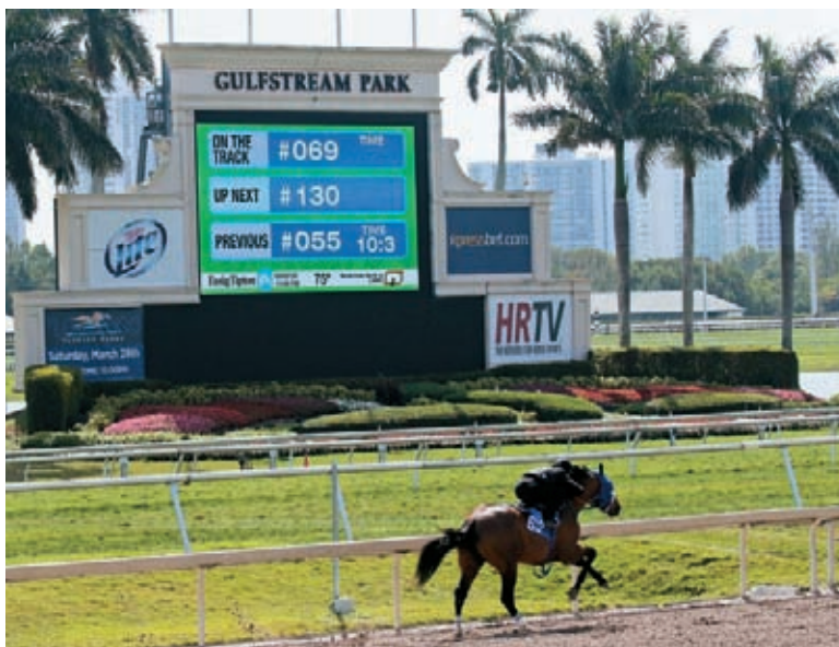
Horses worked on Gulfstream Park's main track