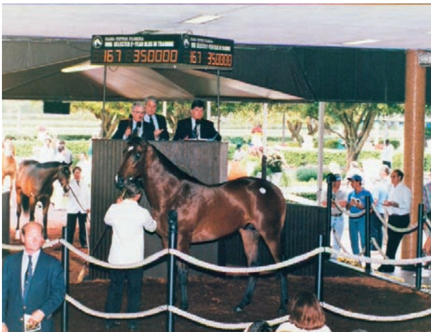
For years the Fasig-Tipton Florida Sale was held at Calder Race Course