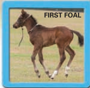
'15 Bedarra ($404,294)