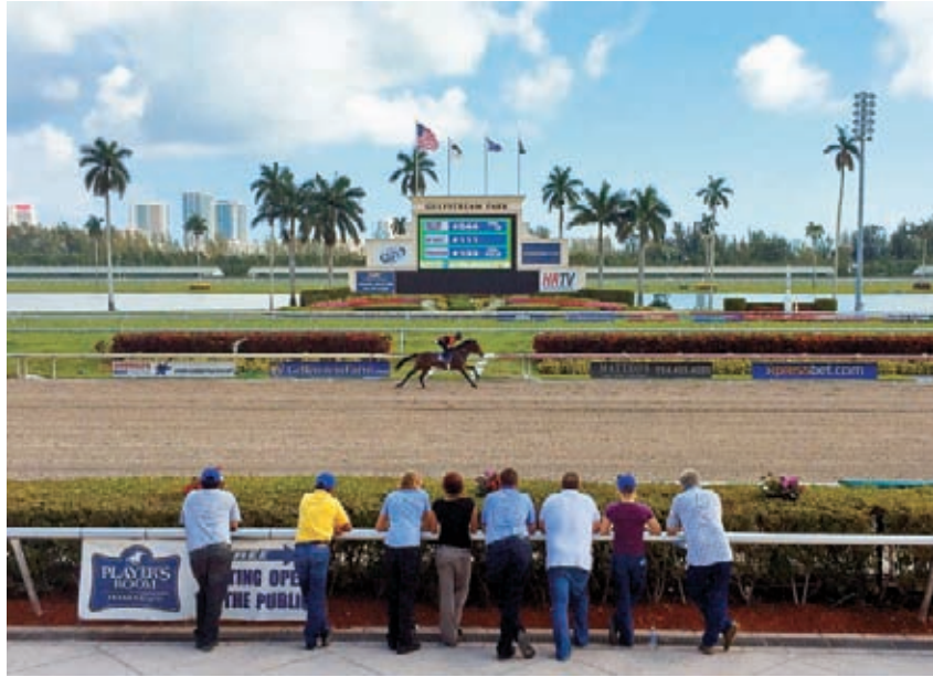
Horsemen viewing the under tack show at Gulfstream Park