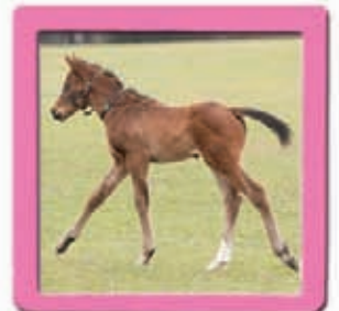
'15 Shake Off (SW)