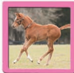
'15 Onemiracleatime (Graded stakes-producer)