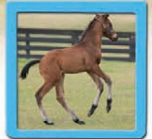
'15 Darby Rose Multiple stakes-producer (G2)