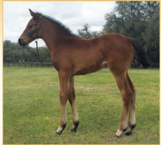
'15 filly - Outstanding Henny, by Hennessy