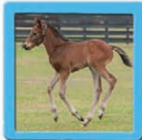
'15 Jitterbug Blues (Wnr, MSP)