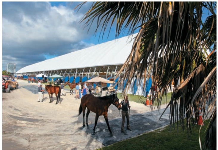
Juveniles on display at the temporary facilities at Gulfstream Park