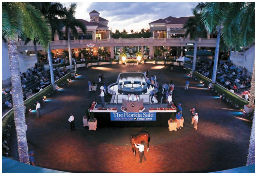
There was "electricity and excitement" to the sale this year, which started at 4 p.m.