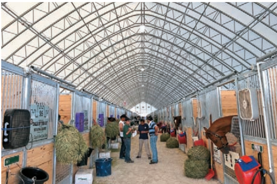
New barns were constructed in the parking lot to house the sale horses