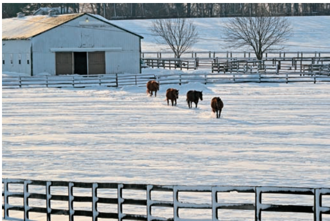
Mares turned out at Shamrock Farm