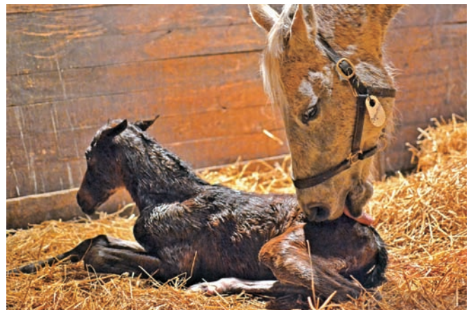
One of Shamrock's latest arrivals