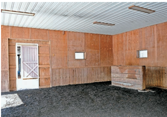
The breeding shed at Shamrock Farm