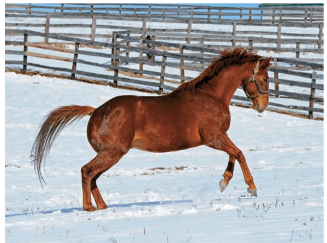
Stallion Admiral Alex enjoys a romp in the snow