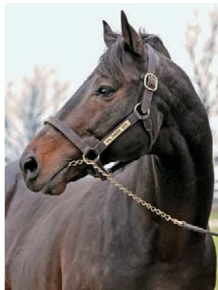
Baltimore Bob, a son of leading sire Malibu Moon, stands at Shamrock Farm