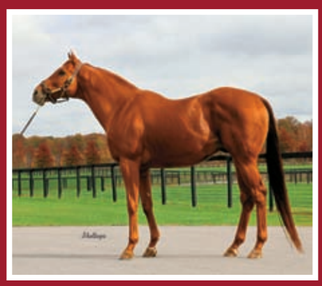
2015 Fee: $2,500 Nominated to Breeders' Cup & Indiana-Bred Programs