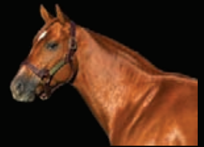
D' FUNNYBONE By D'wildcat / $2,500 LF