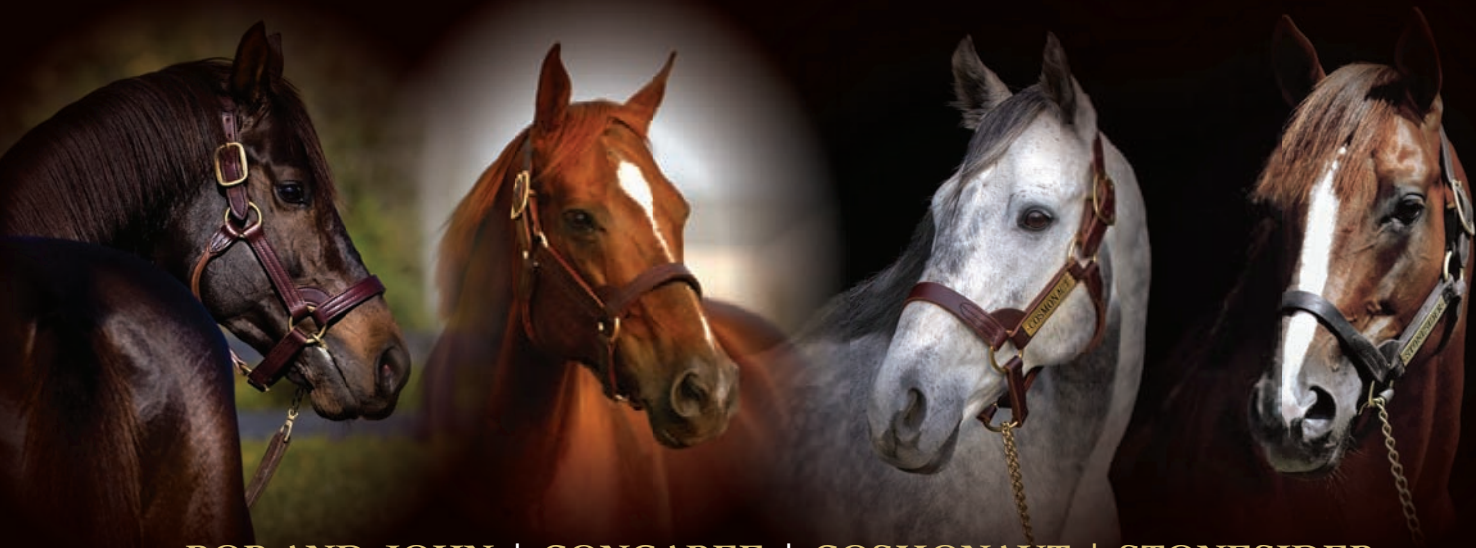
BOB AND JOHN | CONGAREE | COSMONAUT | STONESIDER