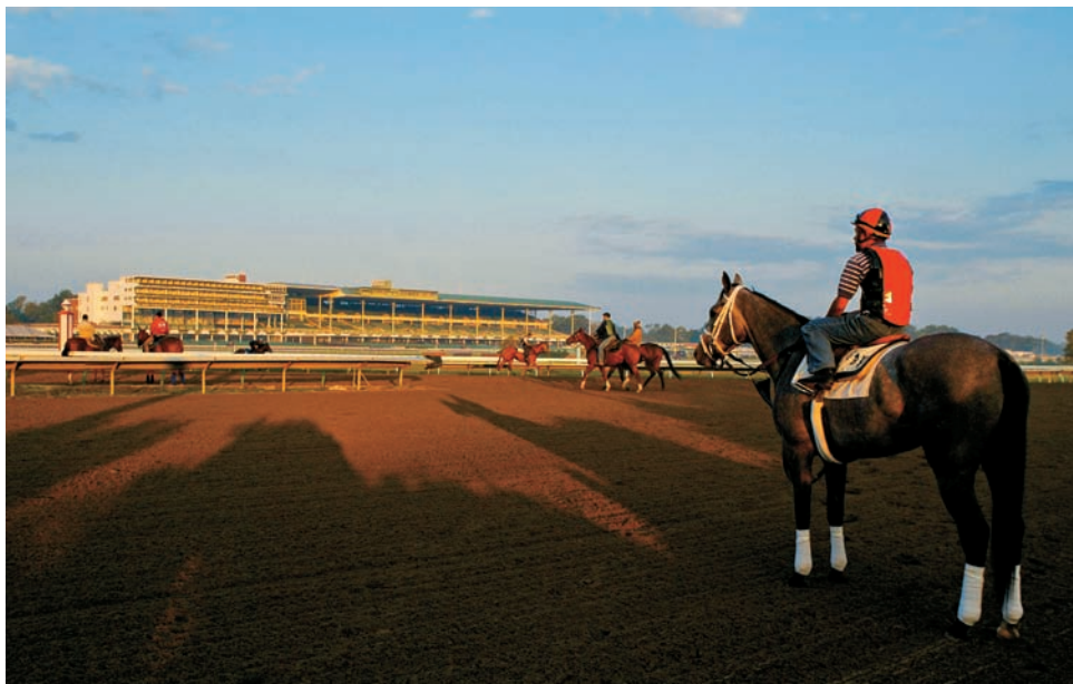
Monmouth Park, which opened in 1946, begins its 2015 summer meet May 9