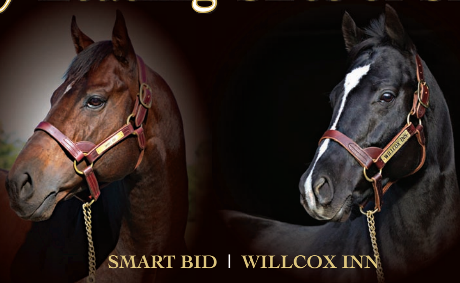
SMART BID | WILLCOX INN