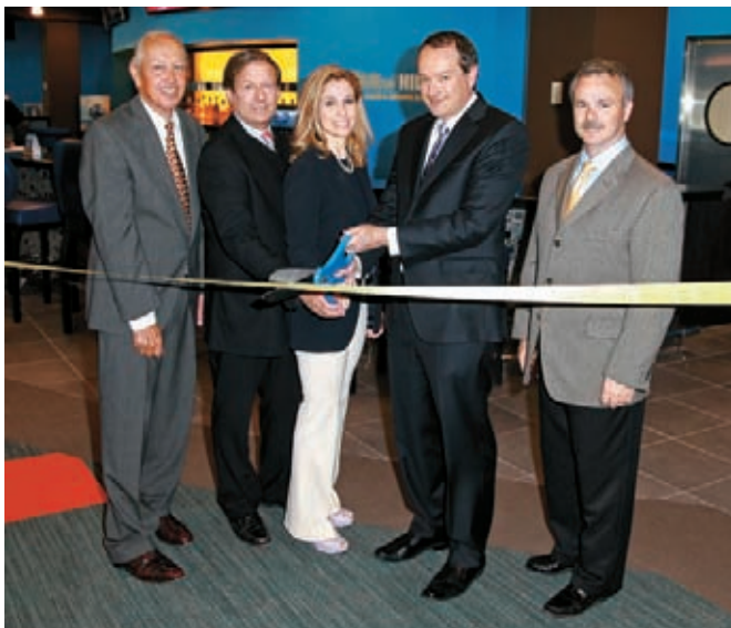
Top: Opening the 2013 season after Super Storm Sandy; below, official opening of the William Hill sports bar in '14