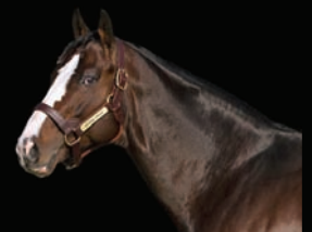
SOARING EMPIRE By Empire Maker / $3,500 LF