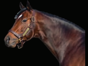
GIANT SURPRISE By Giant's Causeway / $2,500 LF