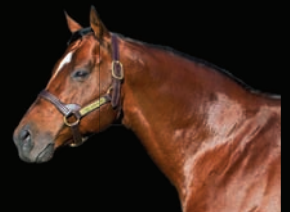
POSSE By Silver Deputy / $5,000 LF