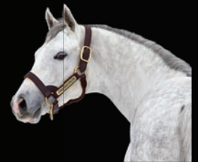
HONORABLE DILLON By Tapit / $5,000 LF