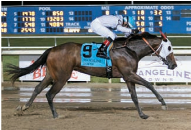
Forest Lake winning last year's Evangeline Downs Starlet Stakes