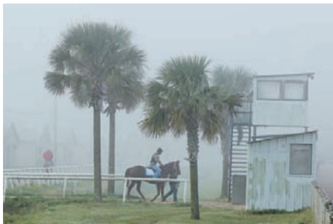
Heading for a morning work at Evangeline Downs

Their oldest daughter—12-year-old Lauren—plays on a sixth