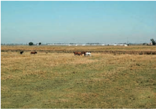
Woodbridge Farm has been a horse farm since World War II