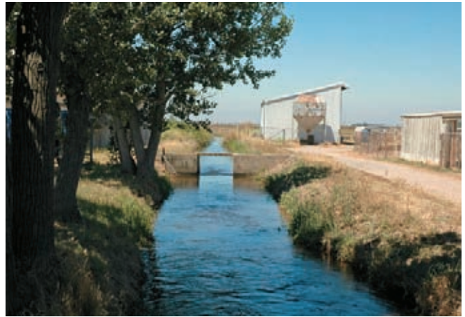
The wooden bridge that spans an irrigation canal