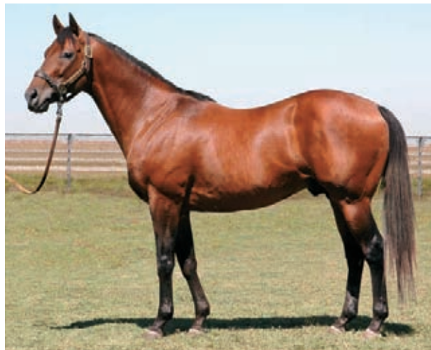
Tannersmyman stands at Woodbridge