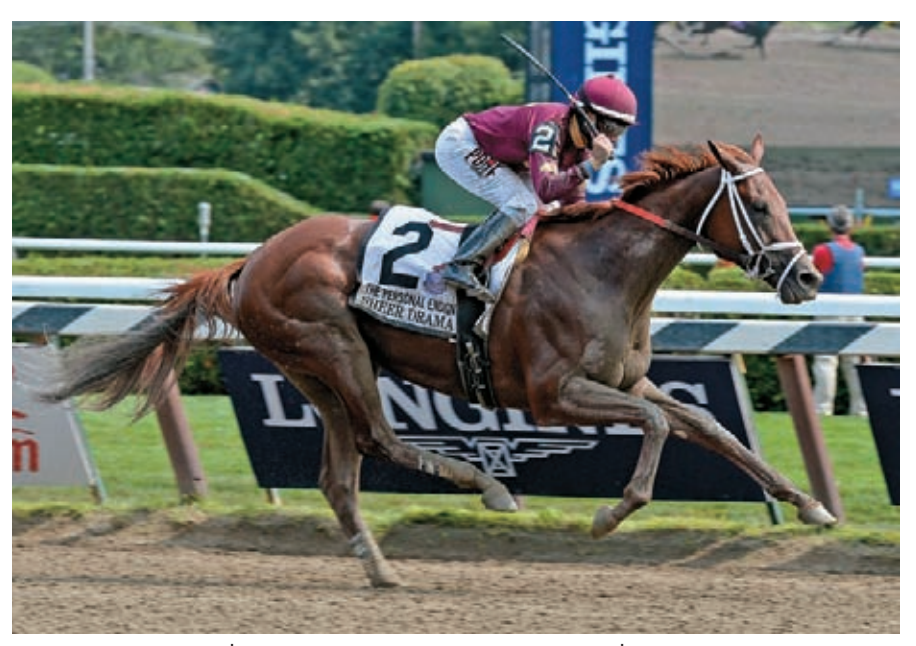
Sheer Drama winning Saratoga's Personal Ensign