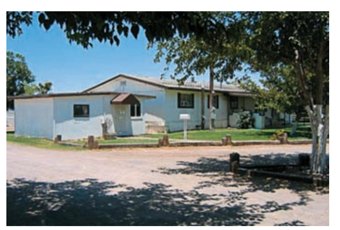
The office at A & A