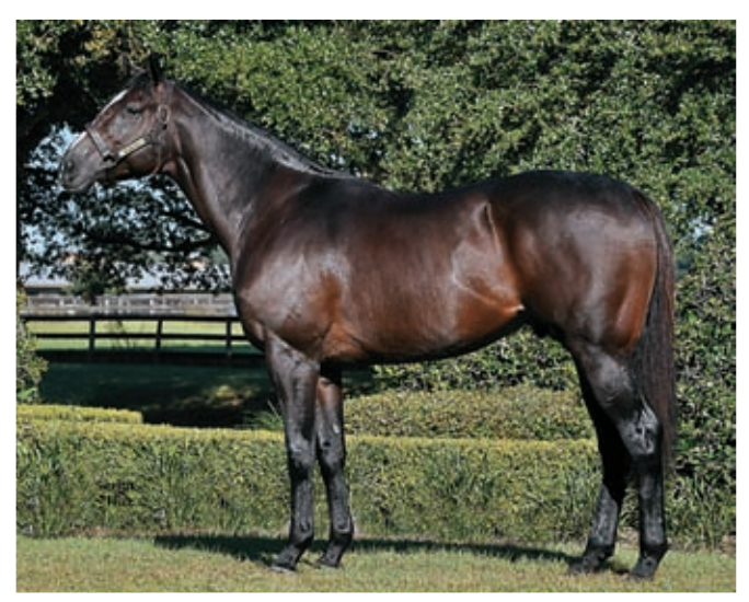
Archwarrior will stand his first season at A & A in 2016