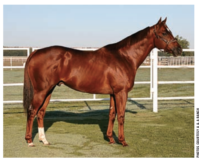
A & A stallion Diabolical, the state's leading sire