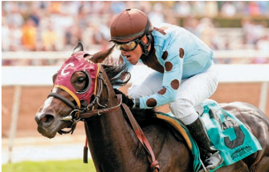
Prize Exhibit winning the Senorita Stakes at Santa Anita in June