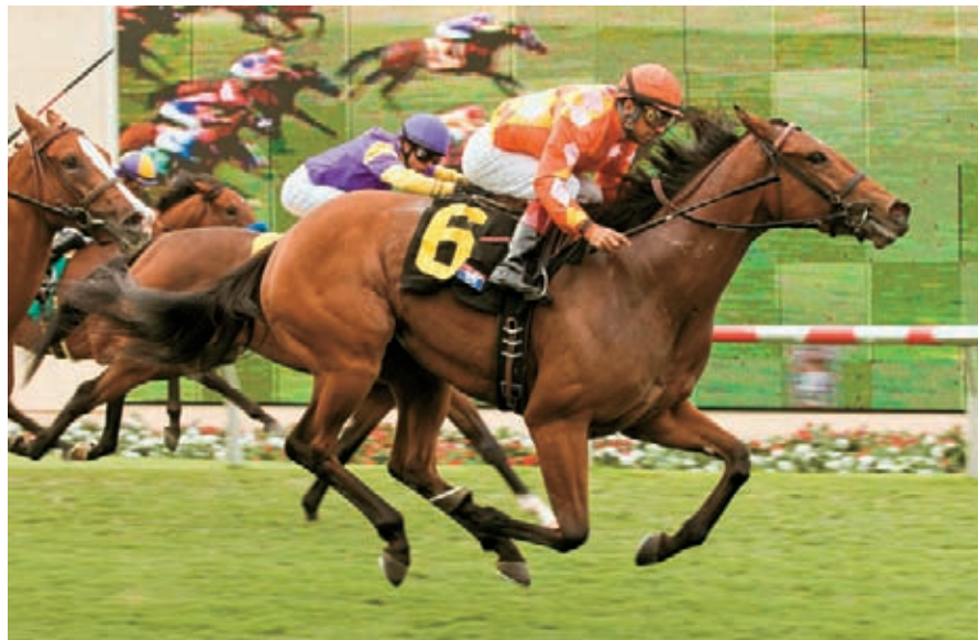
Evening Jewel, winning the 2010 San Clemente at Del Mar