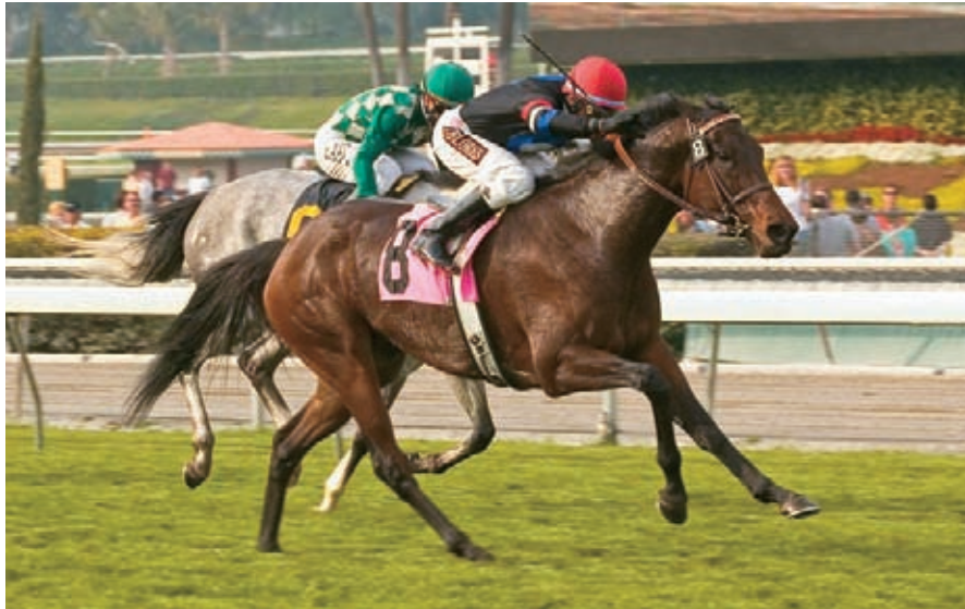
Cassidy-trained Moscow Burning, a $25,000 claim, earned more than $1.4 million

(continued from page 70) with the apt name of Slow Bob.