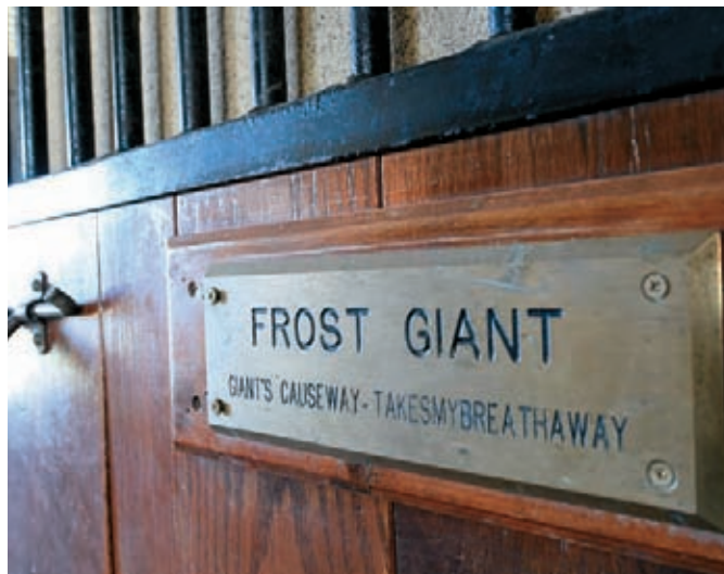
Frost Giant was a surprise hit as the leading first-crop sire and freshman sire in New York for 2012; he moved to Keane in 2013