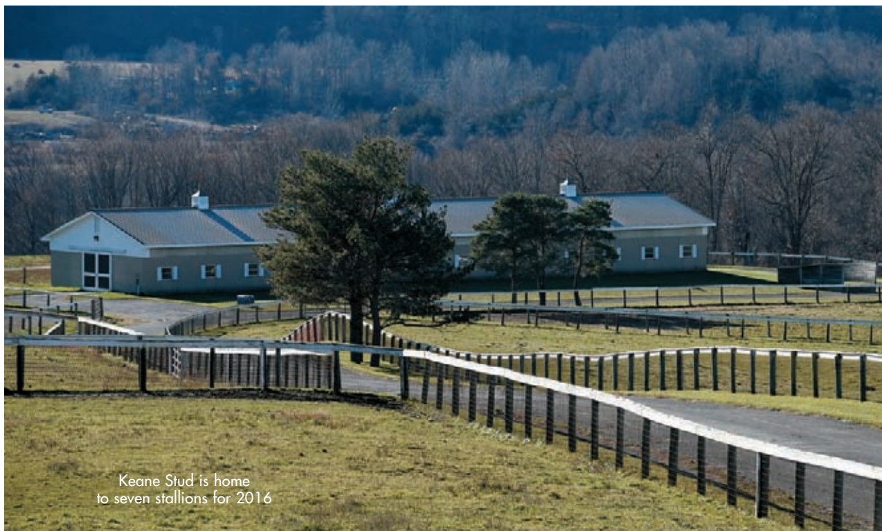
Keane Stud is home to seven stallions for 2016