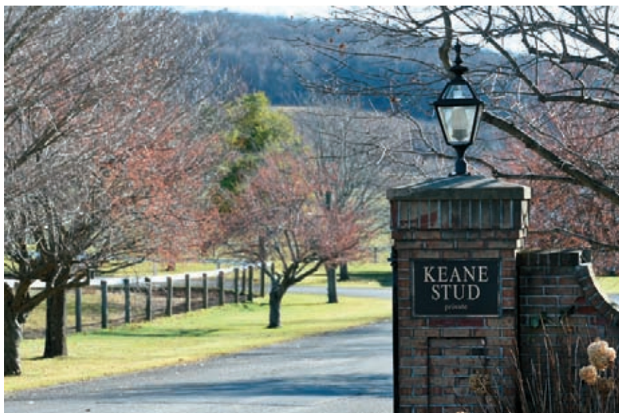
Limestone-rich soils, natural springs are welcoming assets to Keane's client base