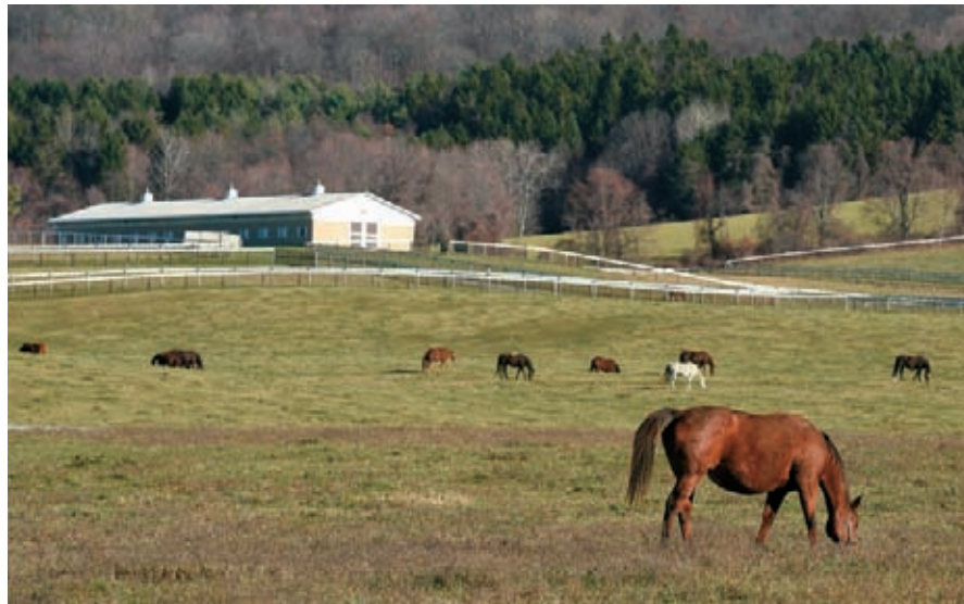
By design the farm is limited in its number of stallions and broodmares