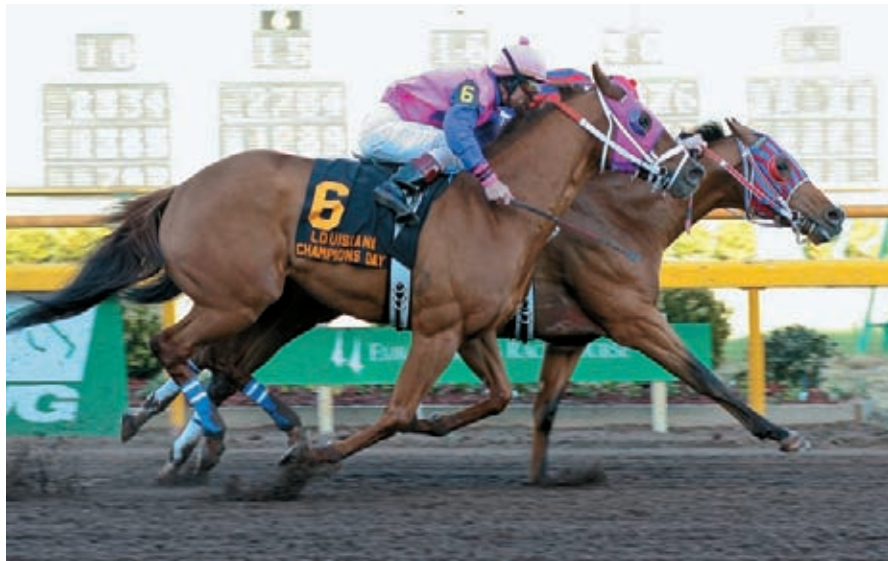
Zarb's Dahar (inside) winning the 2005 Louisiana Champions Day Sprint