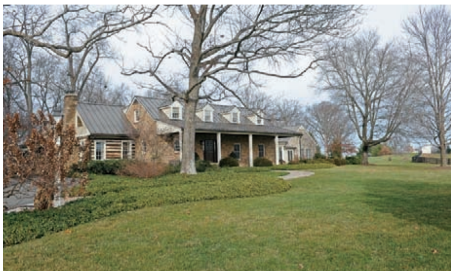
The Woolcotts purchased the 243-acre Woodslane Farm in 2006