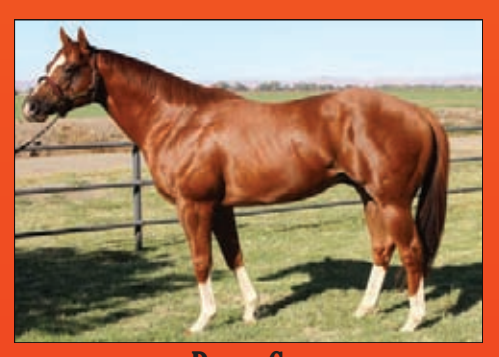
Brave Cat LionHeart-Clever Squaw (Rahy) $1000 LF

Bob Black Jack Stormy Jack-Molly's Prospector (Native Prospector) $2000 LF