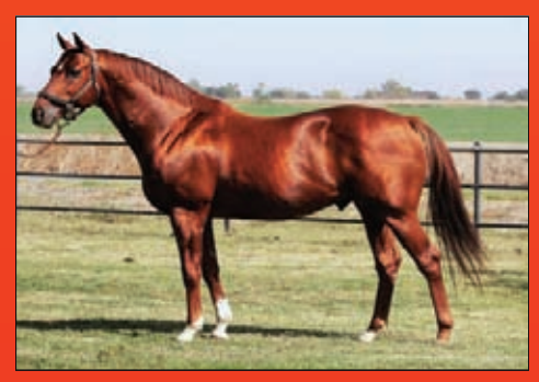
Golden Balls (Ire) Danehill Dancer(Ire)-Colourful Cast (Ire) (Nashwaan) $2000 LF