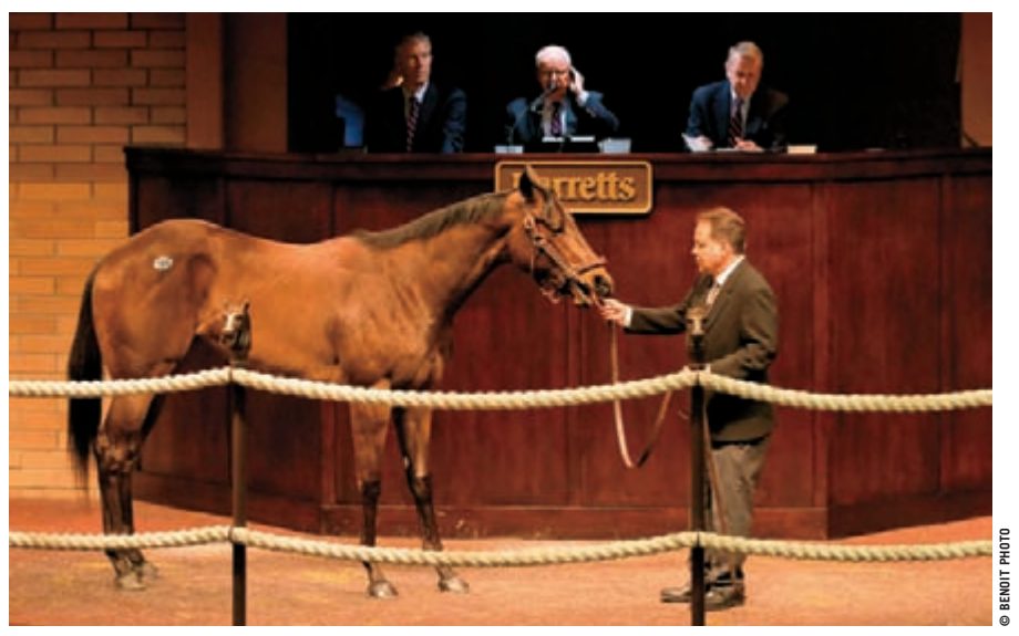
The 2015 Barretts select sale of 2-year-olds averaged $132,909