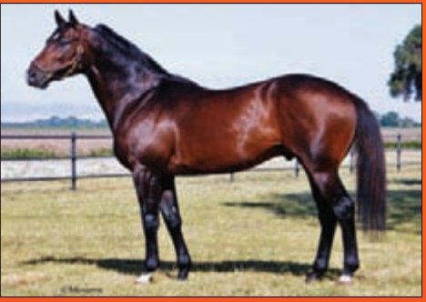
Northern Indy A.P.Indy-Polish Nana (Polish Numbers) $1500 LF