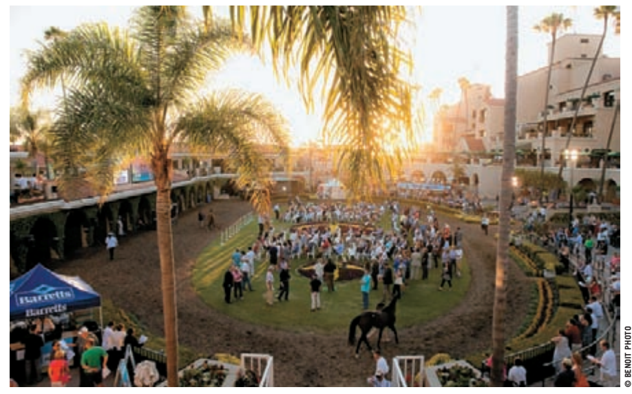
State-bred maiden special weight races at Del Mar go for about $75,000

"That check is written to the owner within 30 days," said Burge. "It is a joint effort between the CTBA and TOC from the purse account. We put up a certain amount of dollars and they matched it from the purse account. This has been extremely successful. Even with smaller foal crops we wanted to increase the value of Calbreds. We wanted to write more maid-