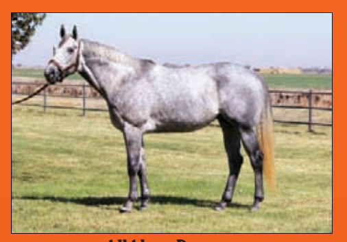
AllAboutDreams Rockport Harbor-Cassidy (Jolie's Halo) $1000 LF