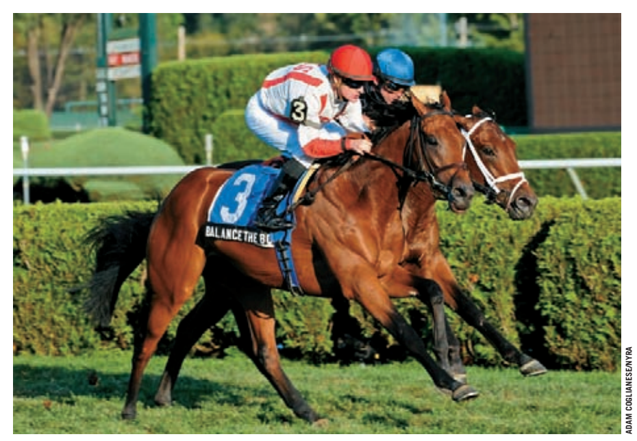
Balance the Books, by Lemon Drop Kid, enters stud this year in the Golden State

California's breeding industry has entered a period of transition concerning its sire power. Perennial leading sire Unusual Heat (see page 36) is 26, and top stallions such as Bertrando, In Excess, and Tribal Rule have passed from the scene. Thus, there is opportunity for new stallion prospects coming in such as grade II winner Balance the Books, grade III winner Govenor Charlie, Stimulus Plan, Curlin to Mischief, Cogito, and Circumference.