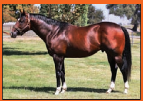
Mesa Thunder Sky Mesa-Citiview (Citi Dancer) $1500 LF