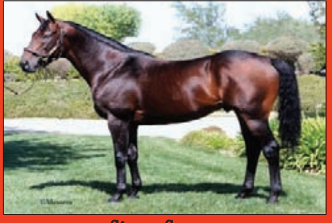
Sierra Sunset Bertrando-Toot Sweet (Pirates Bounty) $2000 LF