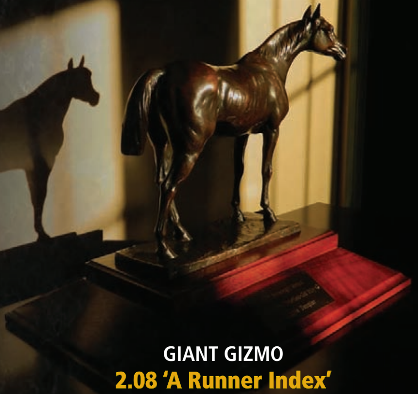
GIANT GIZMO 2.08 'A Runner Index'

Champion 3YO Filly Finalist 2015 Classic winner, Sovereign finalist at 2 & 3, Earnings over $530,000 to three