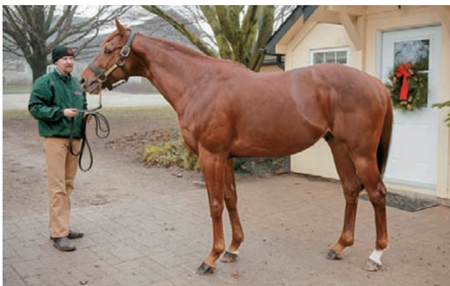
Seven-year-old Nephrite is a son of Pivotal