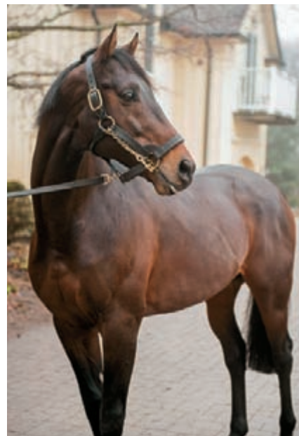
Park Stud's Frac Daddy (by Scat Daddy), left, a first-year stallion for 2016, and Exhi (by Maria's Mon), right