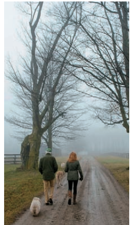
Park Stud expanded to 140 acres

Park Stud stands 9-year-old Exhi for $3,500 (Canadian). The son of Maria's Mon—Soldera, by Polish Numbers, won six of 16 starts and more than $800,000. He won the Coolmore Lexington Stakes (gr. II) at 3 and the Ben Ali the following year, and also won the Victoria Park Stakes and Marine Stakes in Canada.