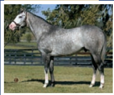
For Irish Road and Star Cat: Special consideration for Stakes-Winning and Stakes-Producing Mares, and Multiple Mare Discounts