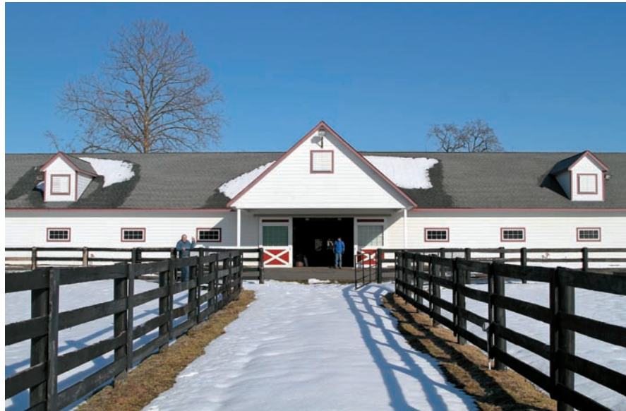
The broodmare barn at New Farm