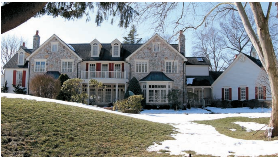
The Novaks' 'neat house' on the farm