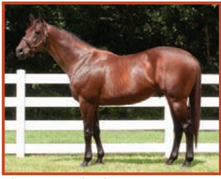
FOUR-TIME LOUISIANA BRED HORSE OF THE YEAR

ALL TIME LEADING LOUISIANA-BRED MONEY EARNER EARNED $1.75 MILLION