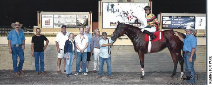
Mojo Racing competes at meets in Oklahoma, Texas, Kentucky, Louisiana, and Arkansas