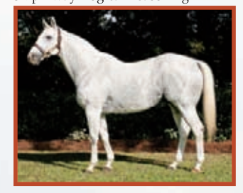
67% WINNERS Ave Earn/Starter $80,000

$1,500 Live Foal 9/1 or $2,000 LFSN Nominated to Breeders' Cup