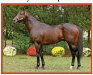
SIRE 8% STAKES HORSES Multiple SW Sprint Specialist