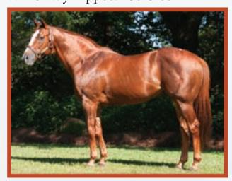
Ave Earn/Starter $38,000 Millionaire G1SW sprinter/miler