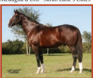
Son of MEDAGLIA D'ORO Out of SARAH LANE'S OATES

$1,500 Live Foal 9/1 or $2,000 LFSN Nominated to Breeders' Cup