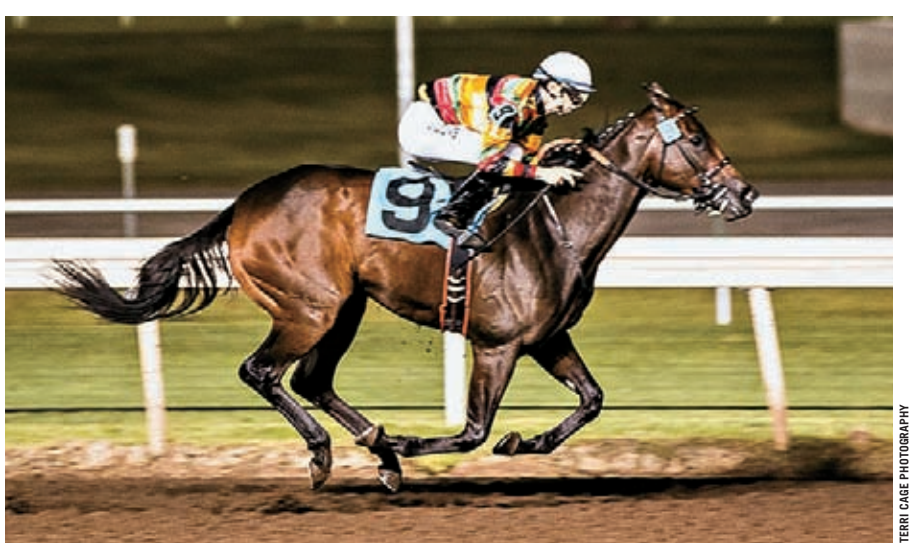
Bling It On Baby won three races and finished second in a stakes for Mojo Racing

(continued from page 40) gram, and we rely on that."