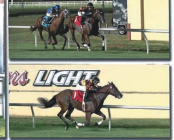
Prue - 2nd Telequest - 3rd 7<sup>1/2</sup> Furlongs in 1:30.15