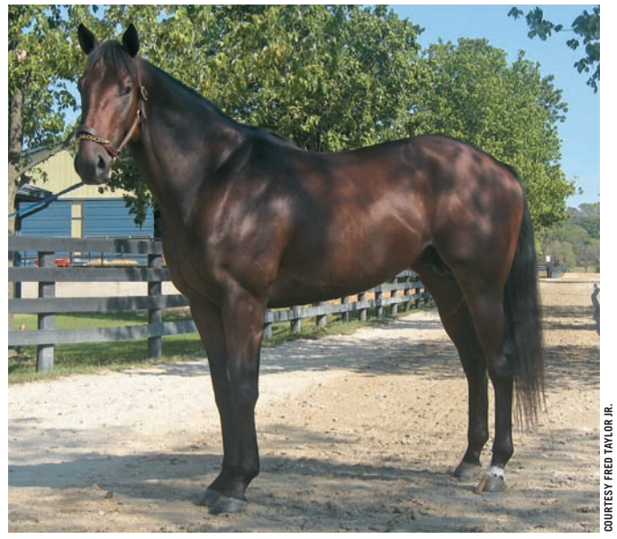
Hollywood Pegasus, Mojo Racing's first runner