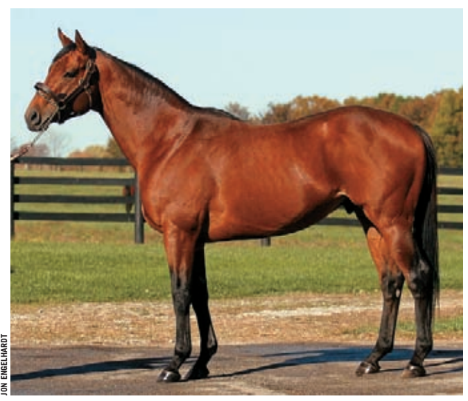
Kettle Corn, a son of Candy Ride, stands at Fair Winds

Poplar Creek is up to 12 stallions this year including Tidal Volume, the only son of national leading sire Tapit to stand in Ohio. He bred the most mares of any other Ohio stallion last year with