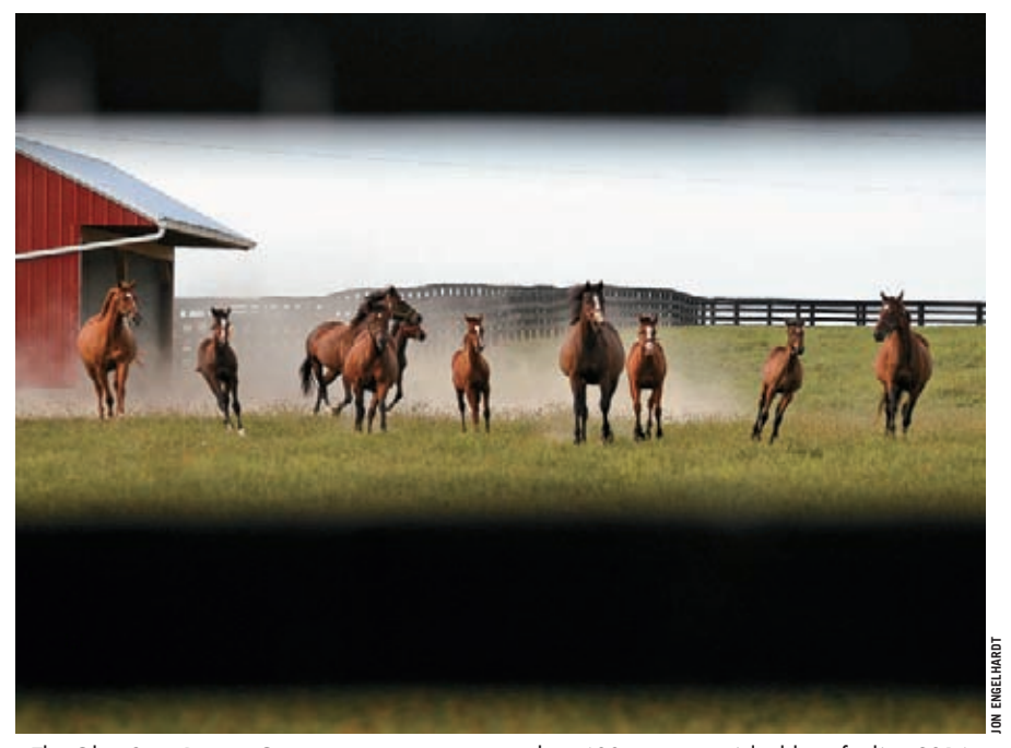
The Ohio State Racing Commission estimates more than 600 mares are 'eligible to foal' in 2016

awards, which this year are estimated at $1.56 million and $230,000, respectively.