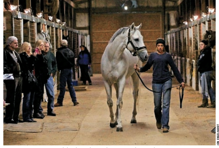
Tapit's son Tidal Volume, being shown at Poplar Creek Horse Center

"We've been happy with the operation. We'll have the Best of Ohio there for the first time this year, and that will be a nice way to show off the facilities."