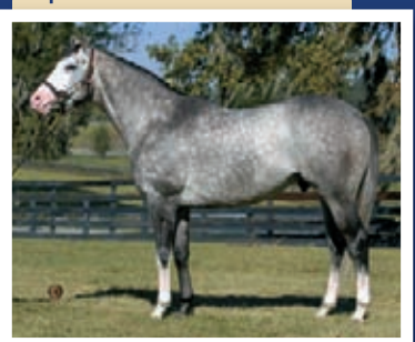
For Irish Road and Star Cat: Special consideration for Stakes-Winning and Stakes-Producing Mares, and Multiple Mare Discounts