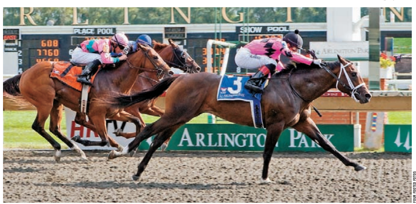
Major Gain, shown winning the grade III Arlington-Washington Futurity, is at McMahon of Saratoga