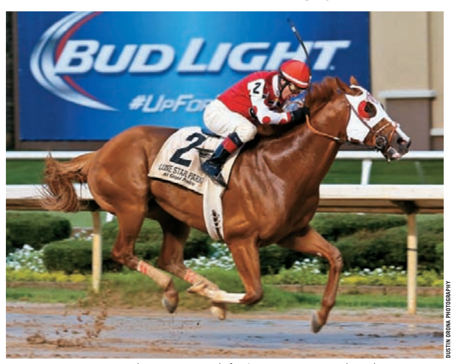
Majestic City, by City Zip, stands for $3,500 at Questroyal North

Questroyal Stud North near Still-(continued on page 42)