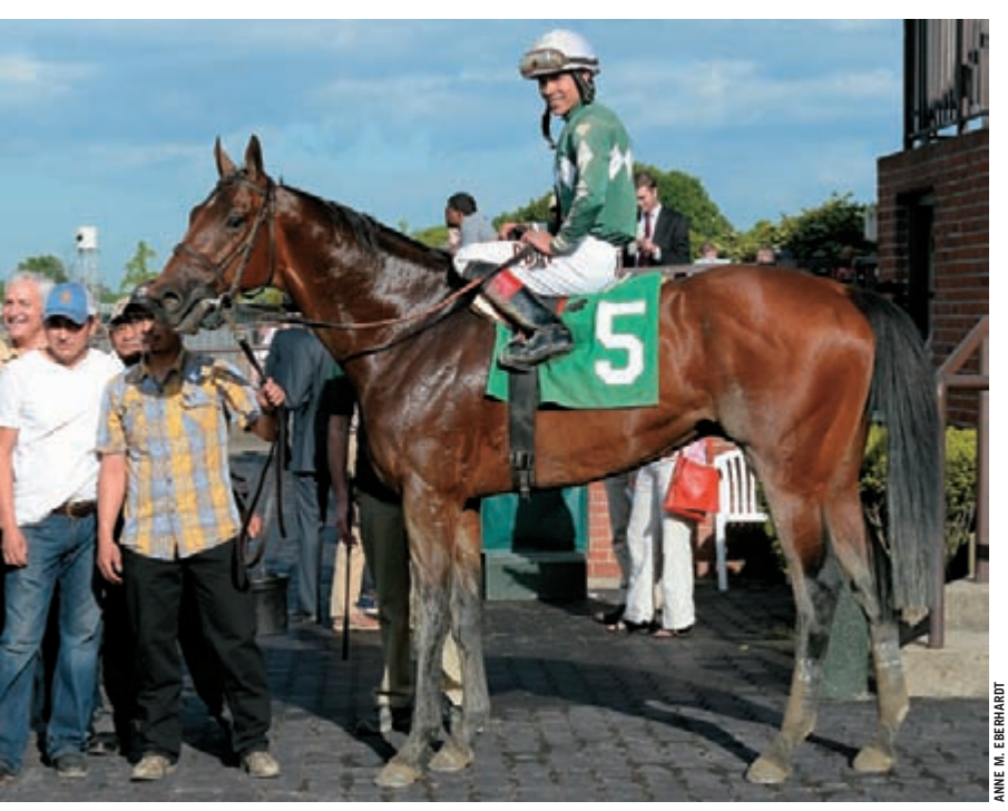
New York-bred Zivo is at Irish Hill Century Farm