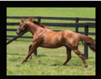
D' FUNNYBONE By D'wildcat | $2,500 LF Co-Leading NE Freshman Sire