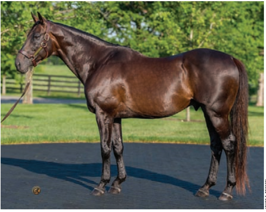
Bellamy Road is the sire of 28 stakes winners