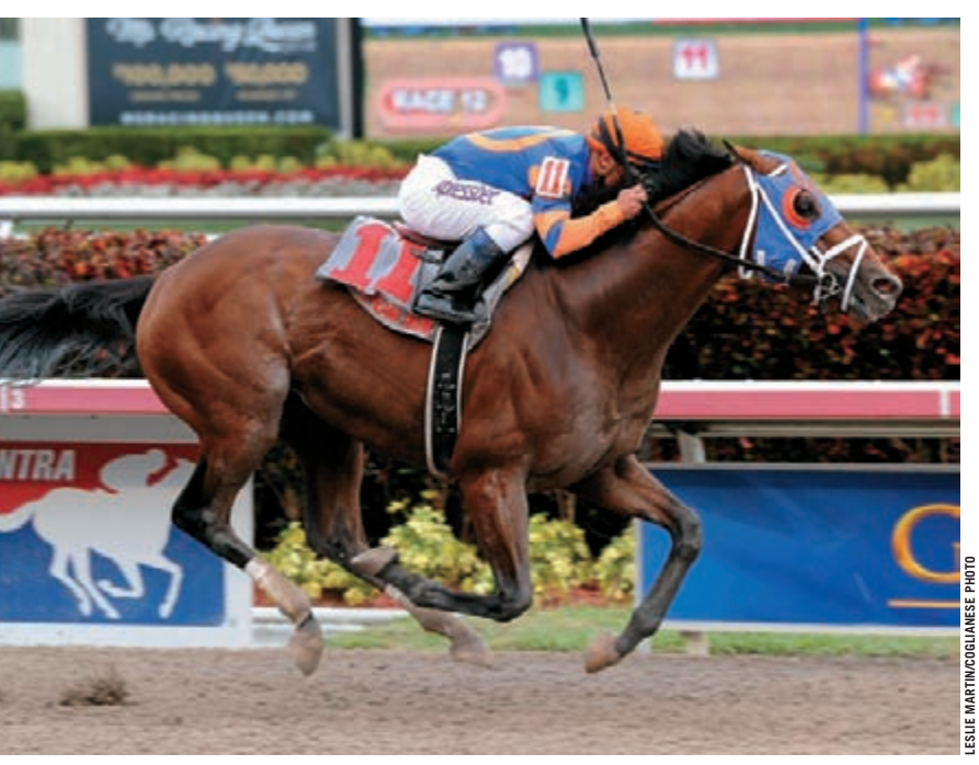
Distance-loving Micromanage stands at Rockridge Stud for 2016

Hold Me Back makes his way to Irish Hill Century Farm. Winner of the Lane's End Stakes (gr. II) at 3 in 2009,