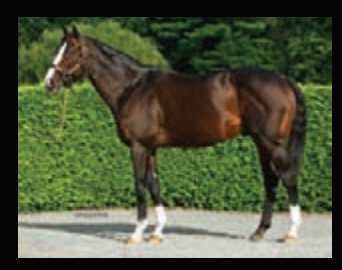
SOARING EMPIRE By Empire Maker | $3,500 LF GSW from Impeccable Family