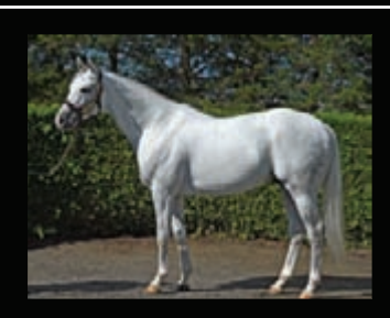
HONORABLE DILLON By Tapit | $5,000 LF G2 SW by Record Sire TAPIT