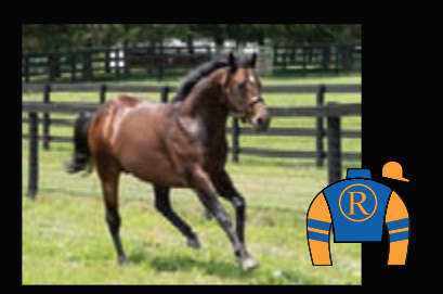
GIANT SURPRISE By Giant's Causeway | $5,000 LF #1 Freshman Sire in NE