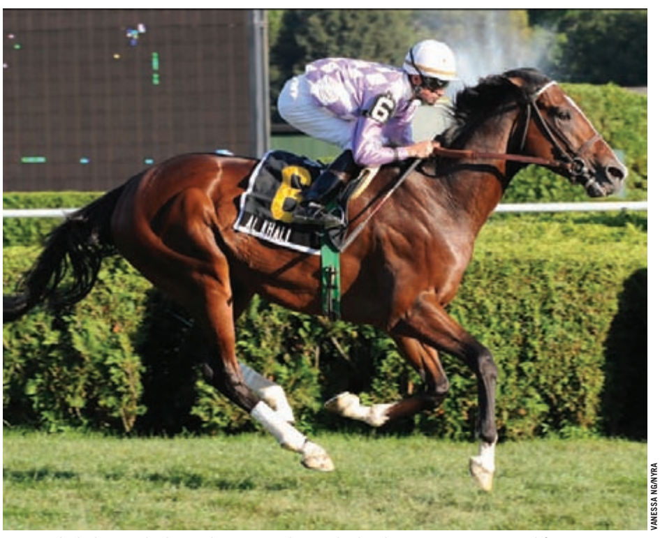
Al Khali, a multiple grade II winner by Medaglia d'Oro, is at Keane Stud for 2016

IF EVER A REGIONAL MARKET was in full expansion mode, it's New York for the 2016 breeding season. The Empire State's stallion roster for this year adds not one, not two, not three, but a dozen incoming stallions. With the growing purses and breeder and stallion awards offered in New York, it represents a bigger gold rush than California in 1849. (continued on page 32)