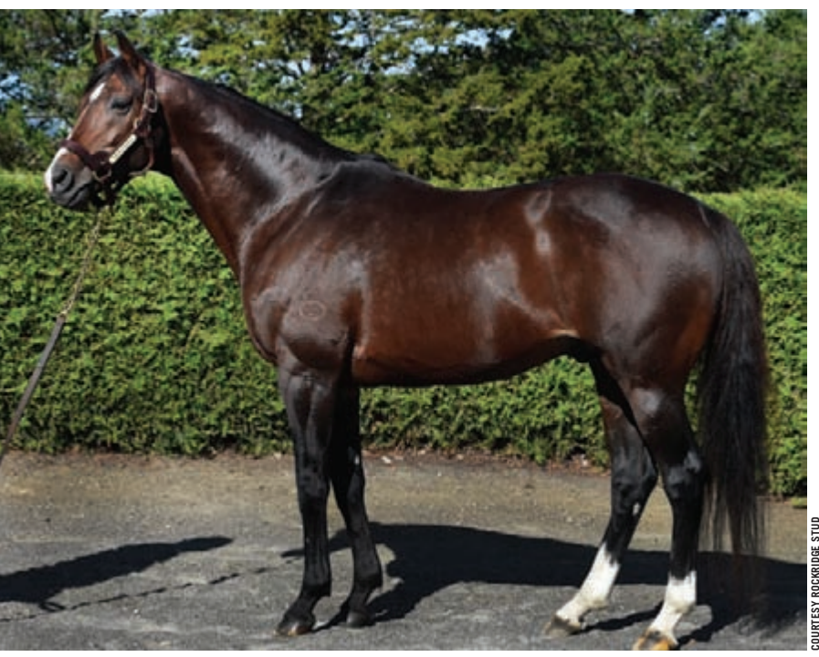
Midas Touch, by Galileo, was second in the 2010 Irish Derby

American Oaks (gr. IT) winner Room Service and a half brother to the stakeswinning Oscar Party. The family in-