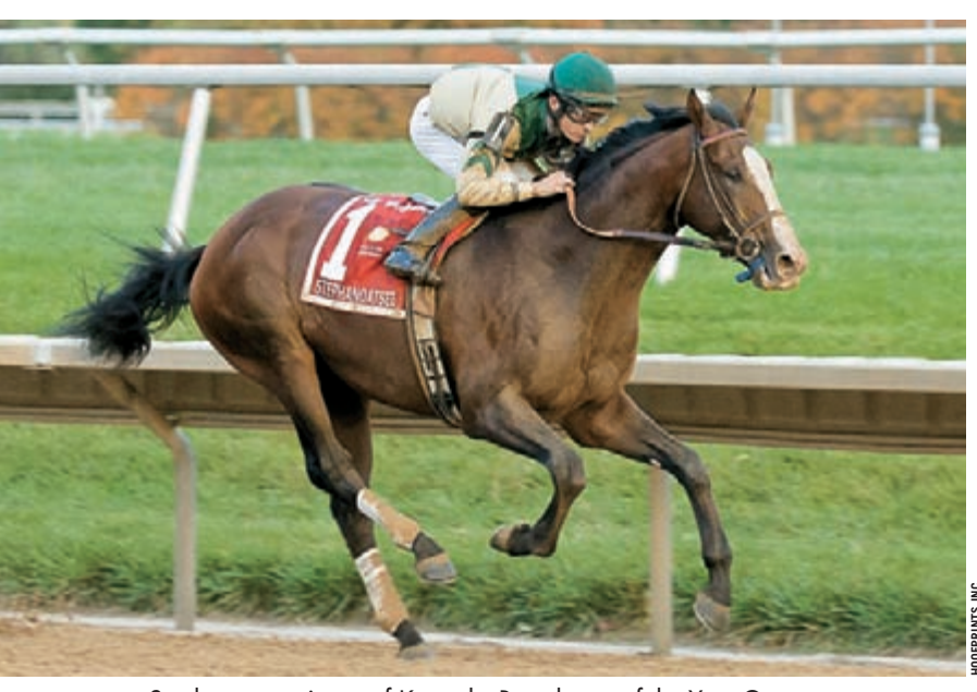
Stephanoatsee is out of Kentucky Broodmare of the Year Oatsee

With 12 new stallions from which to choose from in New York this season, there should be something for everybody.