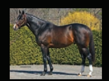
TRINNIBER G By Teuflesberg | $5,000 LF Champion & Breeders' Cup Winner