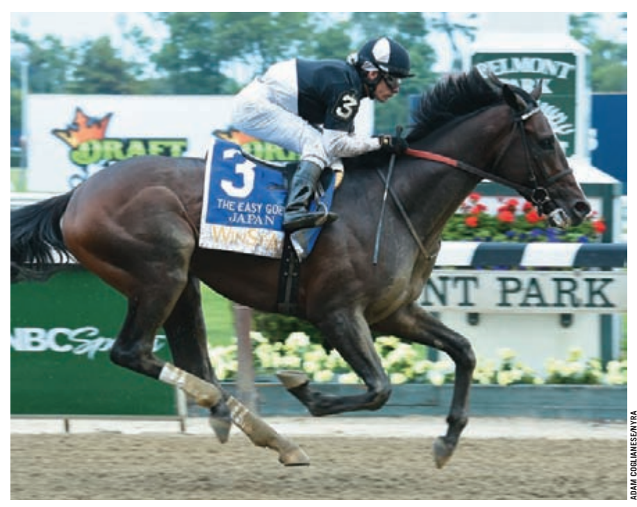
Japan, a full brother to Al Khali (Medaglia d'Oro-Maya, by Capote), stands at Waldorf