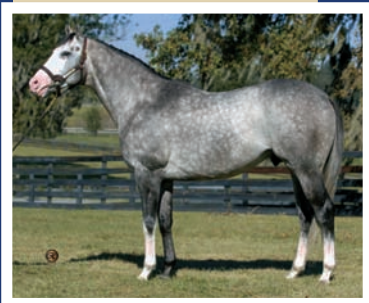
For Irish Road and Star Cat: Special consideration for Stakes-Winning and Stakes-Producing Mares, and Multiple Mare Discounts