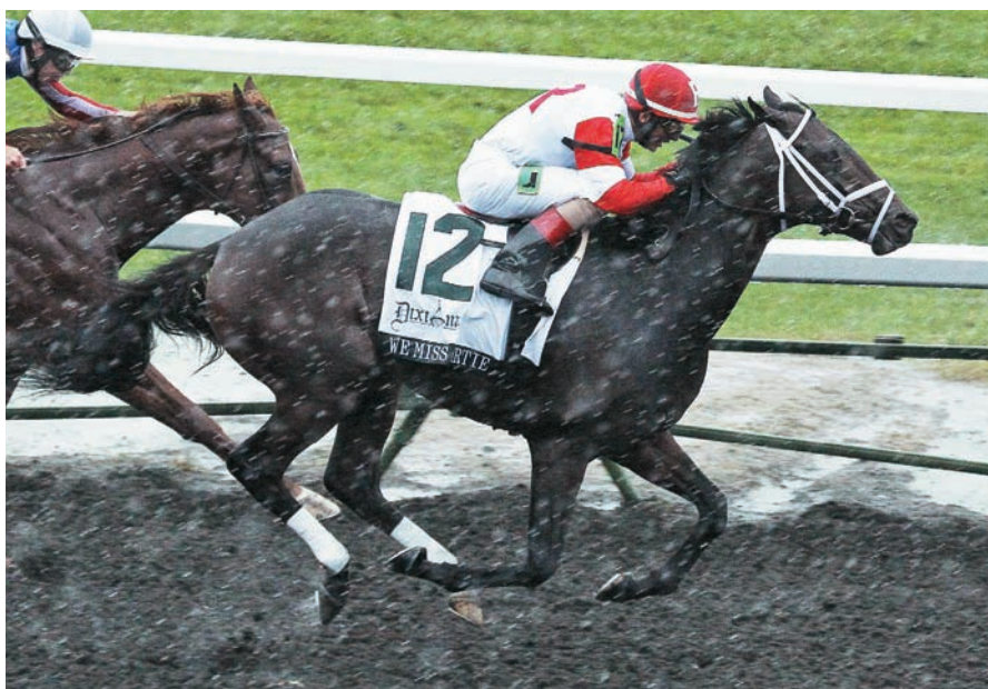
We Miss Artie winning the grade I Breeders' Futurity at Keeneland in 2013