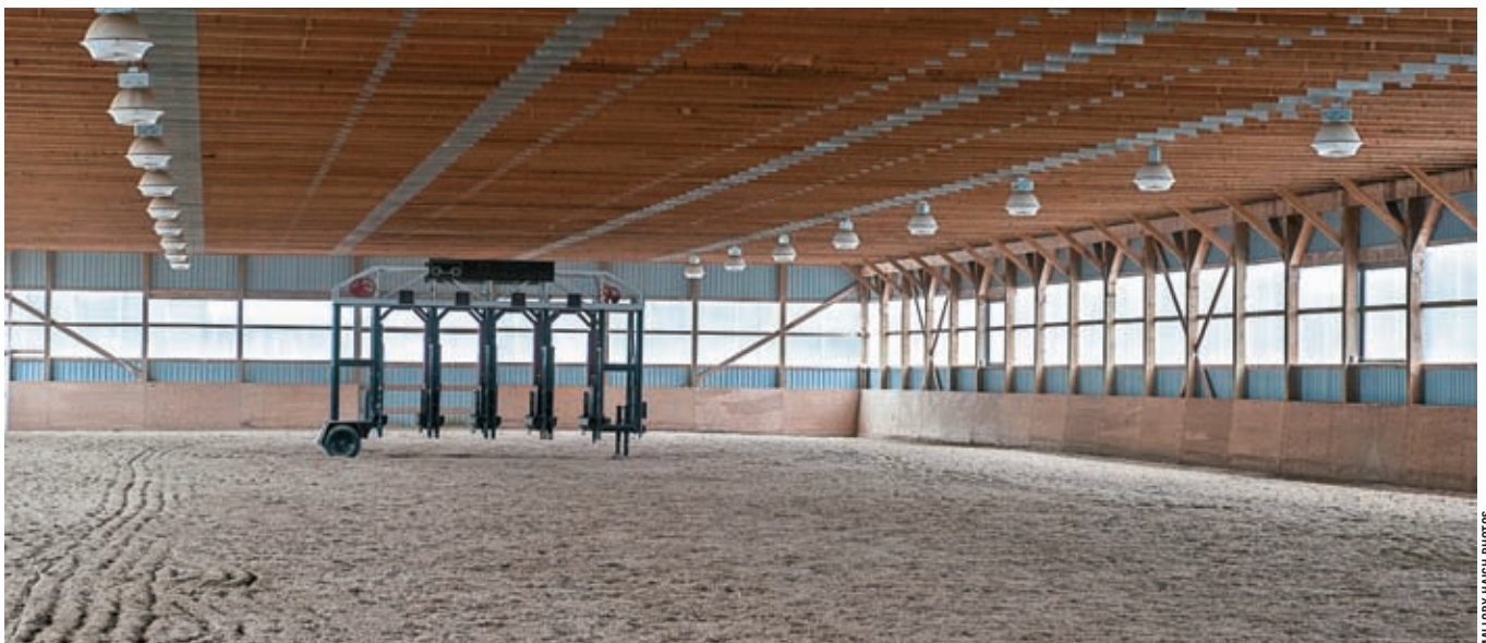
Colebrook's training facility comes in handy during Canadian winters