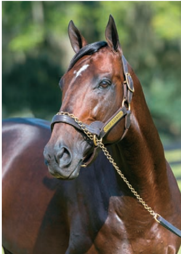
Fort Larned, winner of the 2012 Breeders’ Cup Classic, stands at Adena Springs South