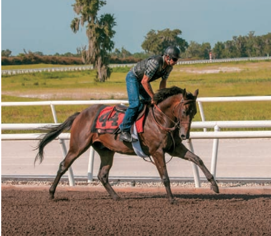
At one point up to 288 horses were being prepped at Adena Springs South for 2-year-old sales or for racing