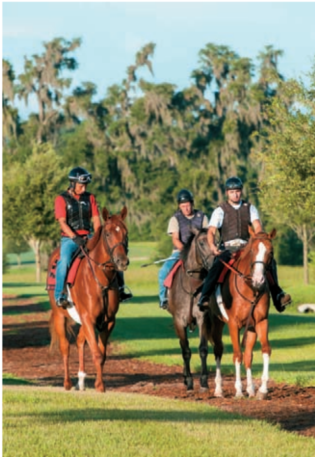
Horses make their way to the training track at Frank Stronach's Adena Springs South