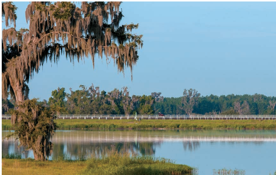
Adena Springs South is a state-of-the-art training center inside 3,800 acres