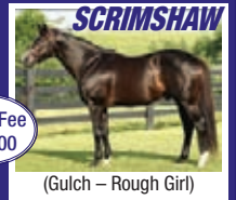
(Gulch - Rough Girl)