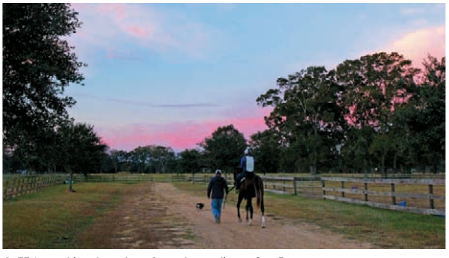
At 5B 'everything slows down for me,' according to Curt Bourque