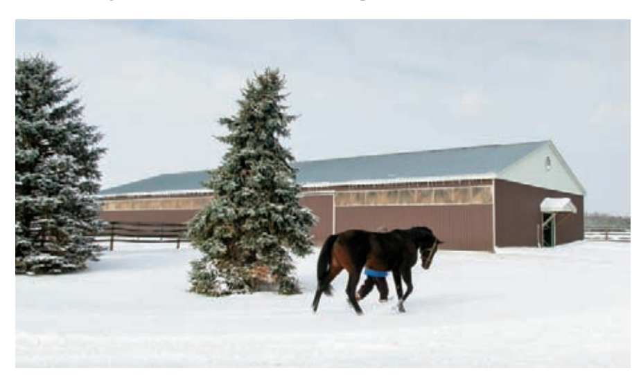
Pool Play, by Silver Deputy, stands at T.C. Westmeath

Across from Pool Play in the stallion barn is the physically imposing Souper Speedy, a son of Indian Charlie from the rich female family of Canadian Broodmare of the Year Passing Mood (dam of Canadian Triple Crown winner With Approval and Belmont Stakes, G1, winner Touch Gold). The 8-year-old won the Jaipur Stakes at Belmont Park as a 4-year-old (via disqualification) and finished second in