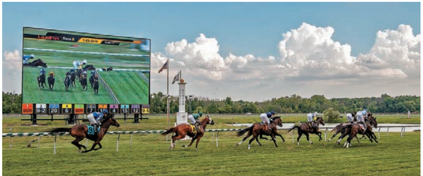
Racing in Maryland is on the improve with enhanced breeder and owner bonuses