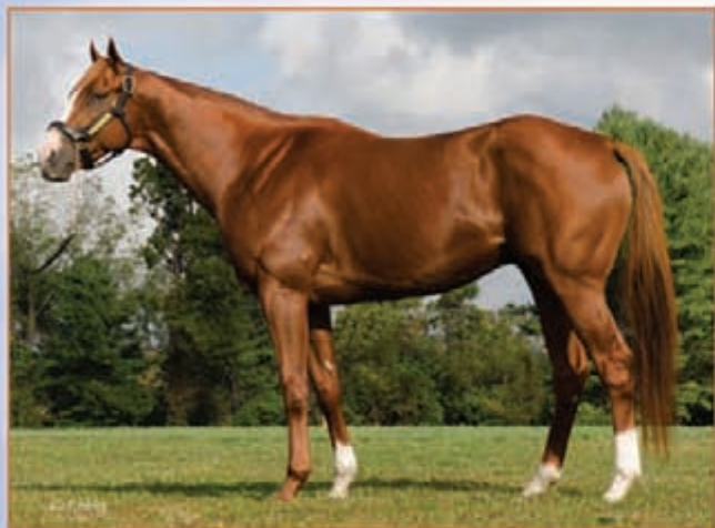
Malibu Moon – Bandstand, by Deputy Minister $3,000 S&N