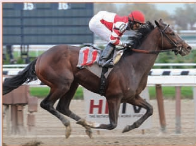
Tapit – Boston Lady, by Boston Harbor $4,000 S&N