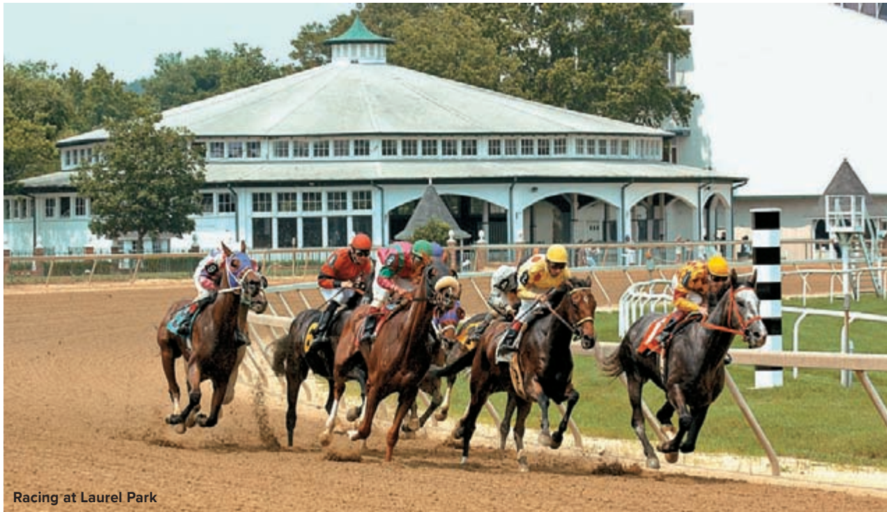
Racing at Laurel Park