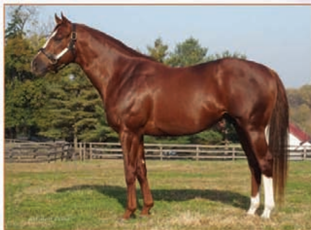
Pulpit – Exogenetic, by Unbridled's Song $4,000 S&N