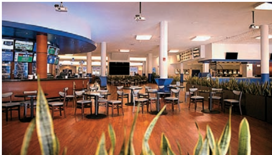
The Maryland Jockey Club has done some major upgrades to Laurel Park