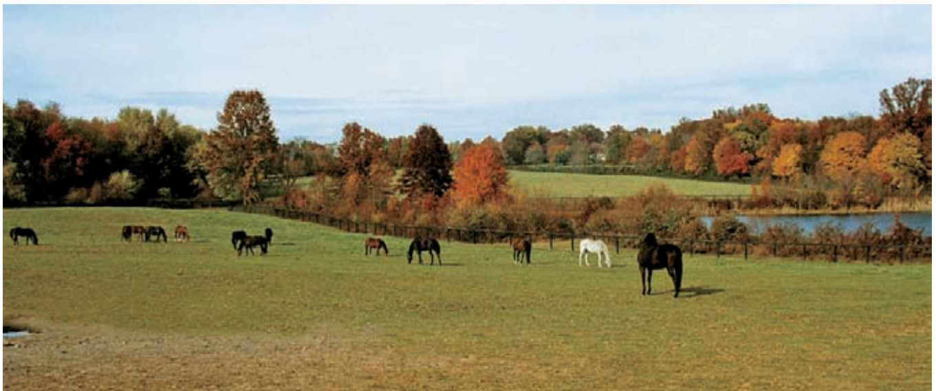
The mare population and foal crops in Maryland are on the rise