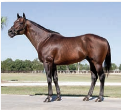
CLOSING ARGUMENT * Stud Fee: $3,000