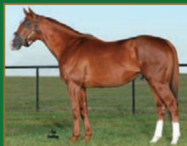
SAVE BIG MONEY (Storm Cat-Tomisue's Delight, by A.P. Indy)

Sire of multiple stakes horse Mimi's Money ($130,073)