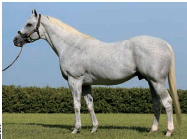
Valor stallion Too Much Bling