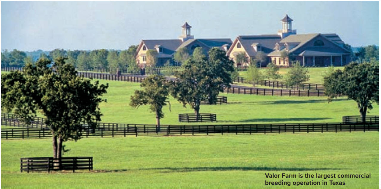
Valor Farm is the largest commercial breeding operation in Texas