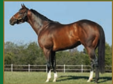
MR. NIGHTLINGER (Indian Charlie-Timely Quarrel, by Time for a Change)

NEW FOR 2017 A Grade 1-placed and Grade 3 winner and sire of LINGERLONGER ($195,883)