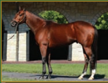
DEN'S LEGACY (Medaglia d'Oro-Sunshine Song, by War Chant)

NEW FOR 2017 A Grade 1-placed and Grade 3 winner by a top international sire