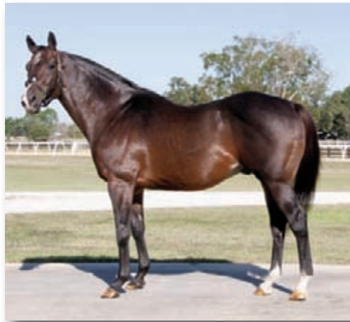
RUN PRODUCTION * Stud Fee: $1,500