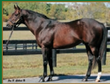
KIPLING (Gulch-Weekend Storm, by Storm Bird)

Sire of Breeders' Cup winner and $3.3 million earner KIP DEVILLE