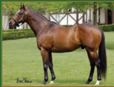
POLLARD'S VISION (Carson City-Etats Unis, by Dixieland Band)

Oklahoma's leading sire by progeny earnings for 2016