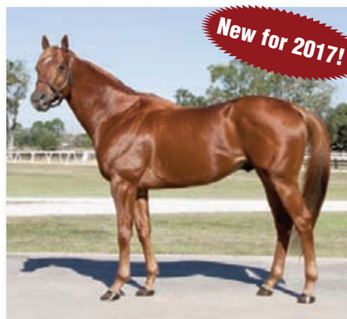
MEAN SEASON Stud Fee: $2,000