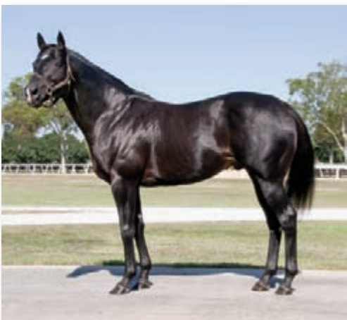
LION'S RANSOM Stud Fee: $750