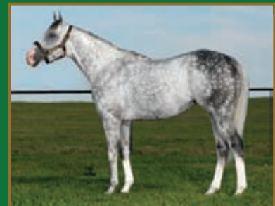
THE VISUALISER (Giant's Causeway-Smokey Mirage, by Holy Bull)

Sire of Will Rogers Downs Horse of the Meet WELDER ($157,997)