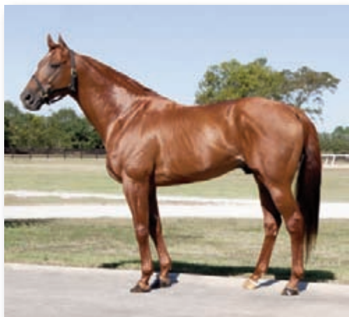
D'WILDCAT * Stud Fee: $2,500