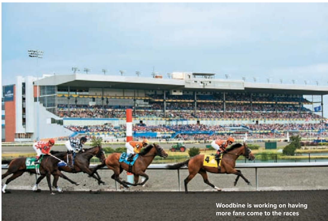
Woodbine is working on having more fans come to the races