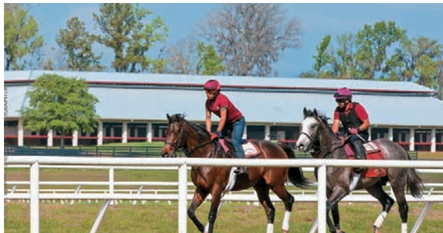
Youngsters in training at Bridlewood

"Obviously, building a breeding program—building a world-class breeding