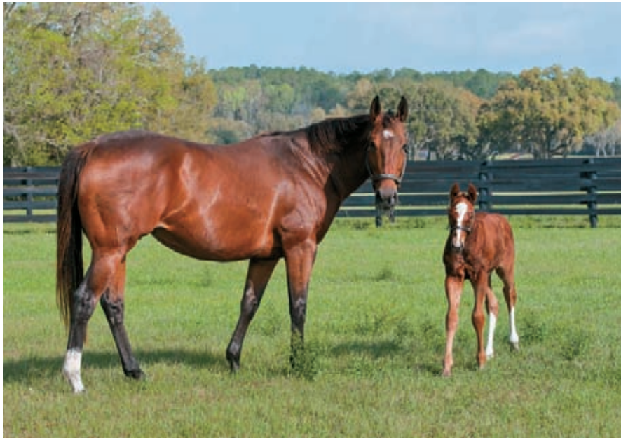
Dancing Secretary, a half sister to Munnings, with her Palace Malice colt