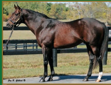
KIPLING (Gulch-Weekend Storm, by Storm Bird)

Sire of Breeders' Cup winner and $3.3 million earner KIP DEVILLE