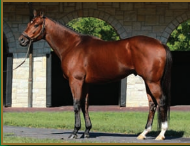
DEN'S LEGACY (Medaglia d'Oro-Sunshine Song, by War Chant)

NEW FOR 2017 A Grade 1-placed and Grade 3 winner by a top international sire