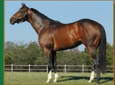
MR. NIGHTLINGER (Indian Charlie-Timely Quarrel, by Time for a Change)

NEW FOR 2017 A Grade 1-placed and Grade 3 winner and sire of LINGERLONGER ($195,883)