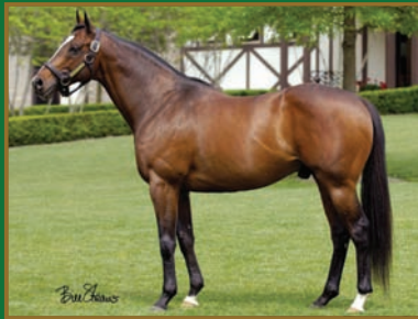
POLLARD'S VISION (Carson City-Etats Unis, by Dixieland Band)

Oklahoma's leading sire by progeny earnings for 2016