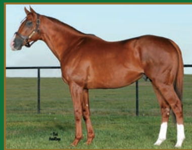
SAVE BIG MONEY (Storm Cat-Tomisue's Delight, by A.P. Indy)

Sire of multiple stakes horse Mimi's Money ($130,073)