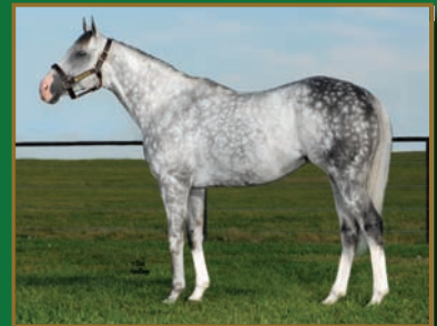
THE VISUALISER (Giant's Causeway-Smokey Mirage, by Holy Bull)

Sire of Will Rogers Downs Horse of the Meet WELDER ($157,997)