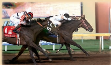
Summer Bird / Nakayama Jeune by Petionville

Congrats... $175,000 OK Classics Cup Winner PHANTOM TRIP!