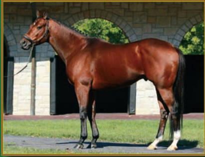
DEN'S LEGACY (Medaglia d'Oro-Sunshine Song, by War Chant)