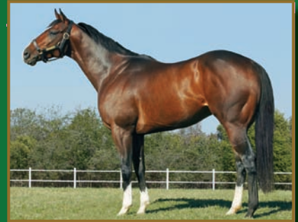
MR. NIGHTLINGER (Indian Charlie-Timely Quarrel, by Time for a Change)