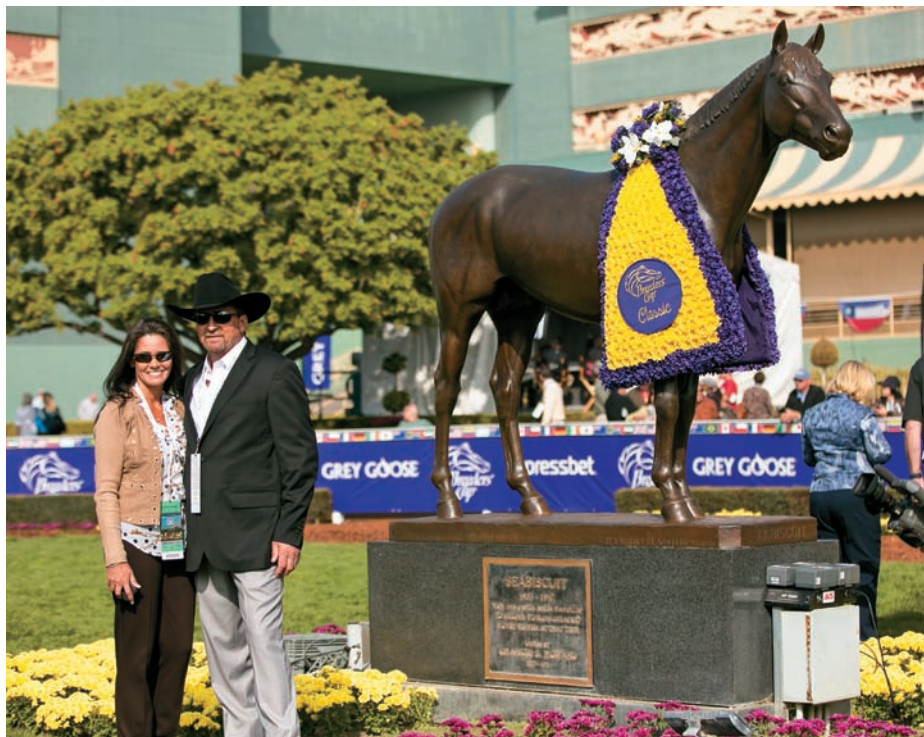
TERRI CAGE PHOTOGRAPHY