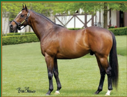
POLLARD'S VISION (Carson City-Etats Unis, by Dixieland Band)

Oklahoma's leading sire by progeny earnings for 2016