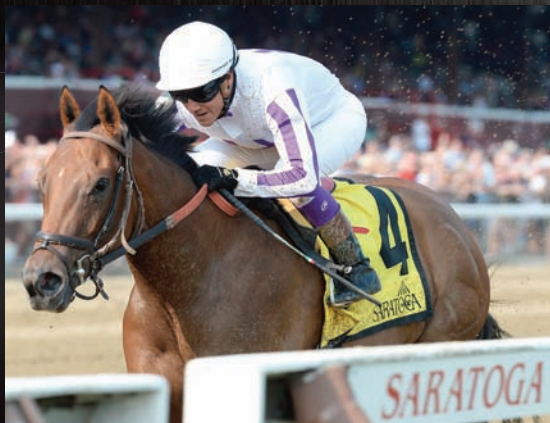
Undefeated 2YO filly DREAM IT IS shown winning the G3 Schuylerville Stakes at Saratoga 7.21.17 by 9 lengths. Purchased by WCTC as a yearling.