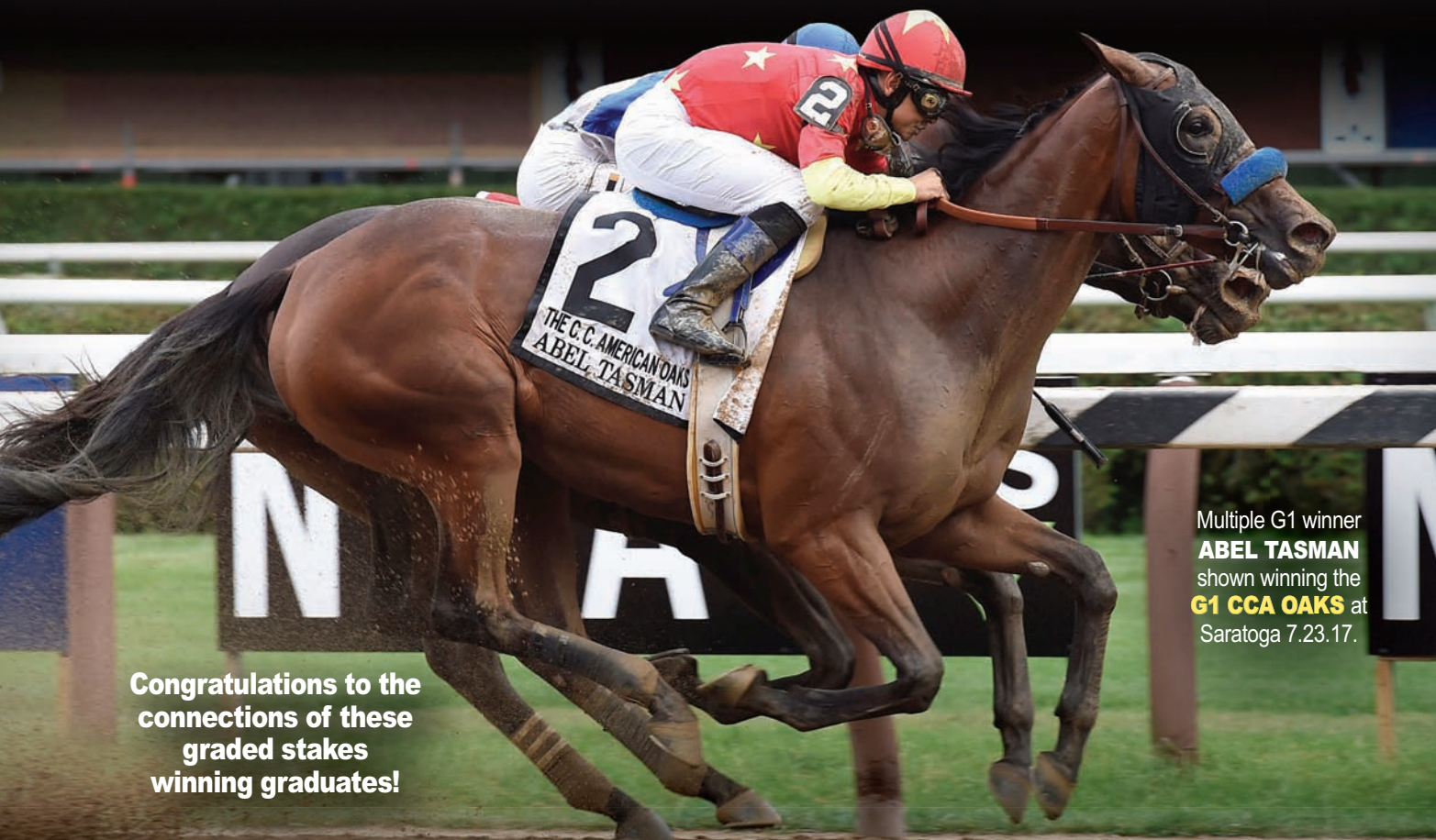
Multiple G1 winner ABEL TASMAN shown winning the G1 CCA OAKS at Saratoga 7.23.17.

Congratulations to the connections of these graded stakes winning graduates!