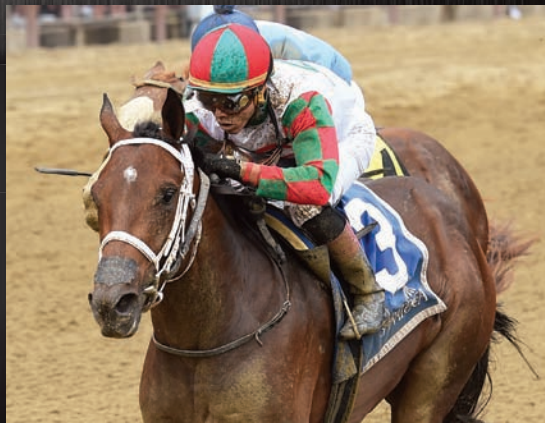
Undefeated 2YO colt FIRENZE FIRE shown winning the G3 Sanford Stakes at Saratoga 7.22.17.