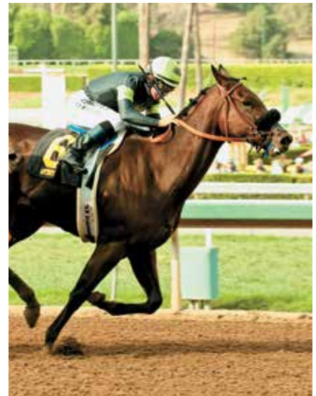
Starlet winner Street Fancy

By champion Street Sense, Street Fancy is out of the stakes-winning Cat Thief mare Bold Angel. Bold Angel is out of Fortyniner Fever, who has produced two other stakes winners and is a half sister to Kentucky Derby (G1) winner and $4 million Keeneland July yearling sale