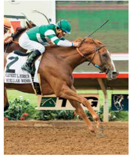
Champion Stellar Wind