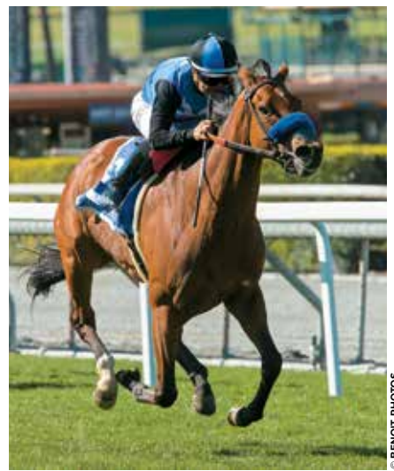
Multiple graded winner Goodyearforroses