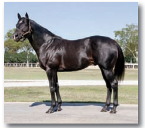
LION'S RANSOM Stud Fee: $750