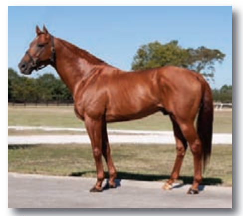
D'WILDCAT * Stud Fee: $2,500