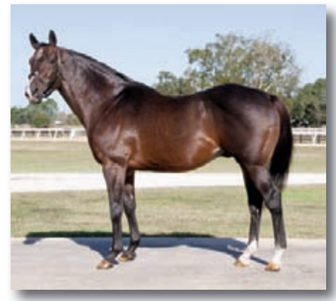
RUN PRODUCTION *