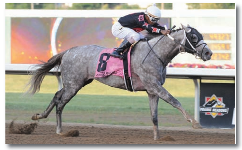
IRON FIST Stud Fee: $6,500 G1 Placed GSW Millionaire retiring to Stud for 2018. The 1st son of Tapit to stand in Louisiana!