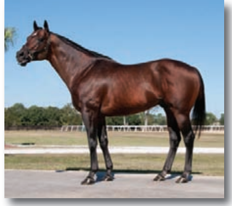
CLOSING ARGUMENT *

Three stallions among the Top Ten 2017 Leading Louisiana Sires!