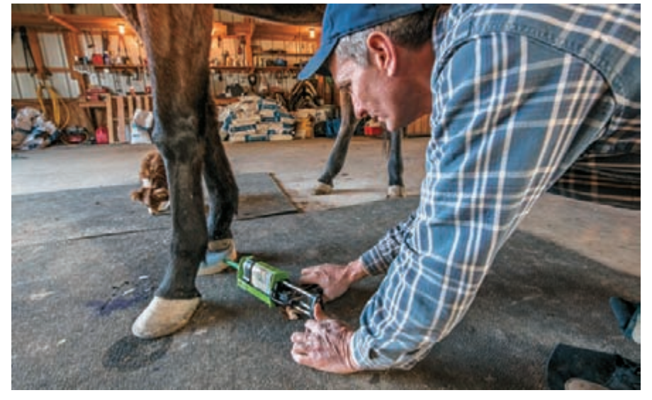
FormaHoof allows the farrier to control the glue that goes on the silicon shoe

"Horses were always part of our lives," she said. "We had backyard horses, and I