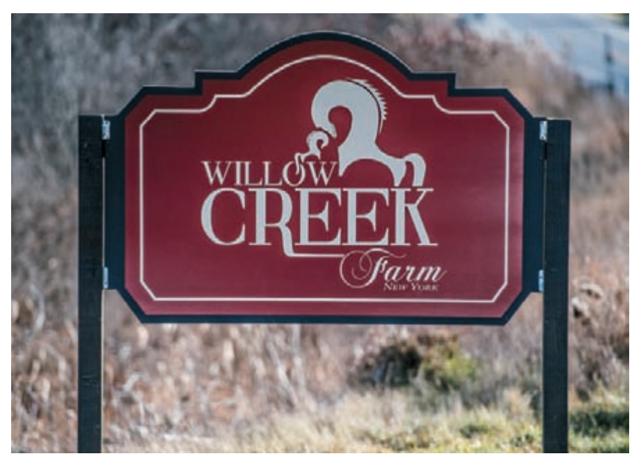
The plan is for Willow Creek Farm to board mares and lay-ups

"We don't want to do things on a huge scale," added Tozzi. "We want to be very