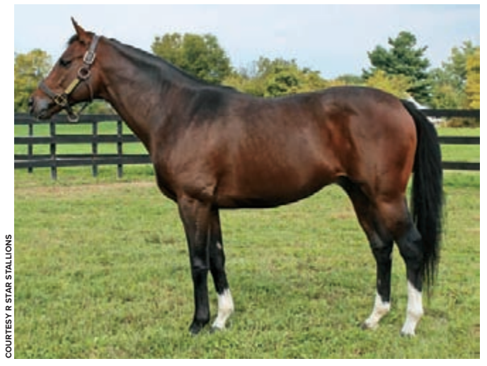
What Now sired two state-bred winners on one card Aug. 30

This November saw a pair of Indiana-bred horses make starts on the two-day Breeders' Cup World Championships card, with Bucchero running fourth in the Turf Sprint (G1T) and Piedi