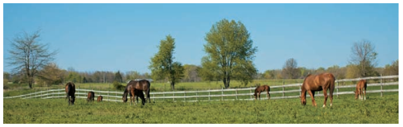
R Star Stallions has added boarding mares and sales prep to their roster of services

Bianchi coming home fifth in the 14 Hands Winery Juvenile Fillies (G1). Bucchero's sire, Kantharos, was standing in