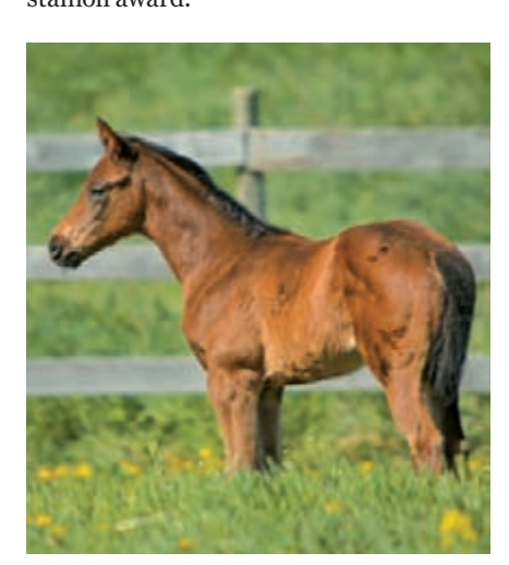
A foal at R Star Stallions

Not only did the Wrights earn the winner's share of the two races, but they also earned another 20% on top of that for a breeder award and another 10% for a stallion award.