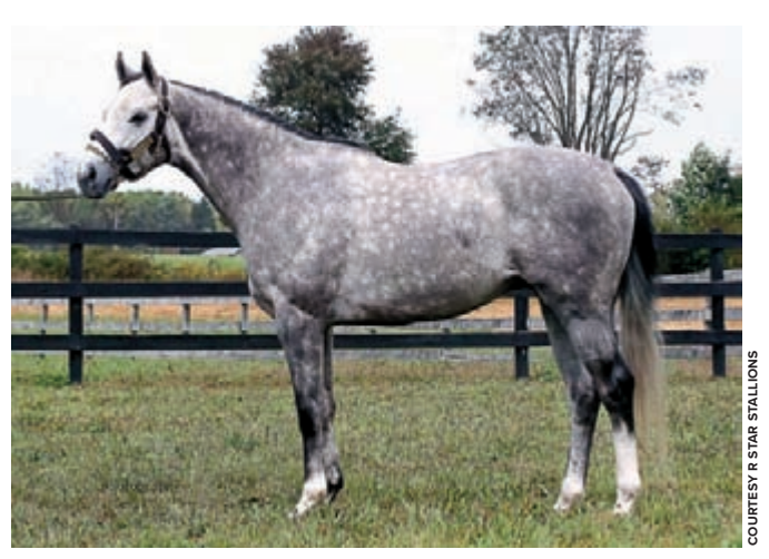
Taprize, by Tapit out of Fun House, stands at R Star Stallions

It wasn't so many years ago when sires with both proven race credentials and elite bloodlines were a challenge to recruit to Indiana. As the incentive programs have gained traction, the over-