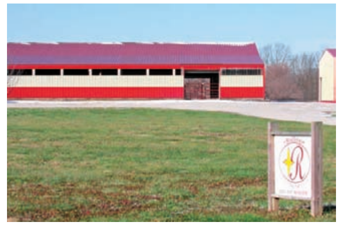
R Star Stallions has been standing stallions since 2010

351 S. US Hwy 31, Seymour, IN 47274 • Phone (812) 523-3805 E-mail: swiftyfarms@swiftyfarms.com www.swiftyfarms.com • www.majestic-harbor.com