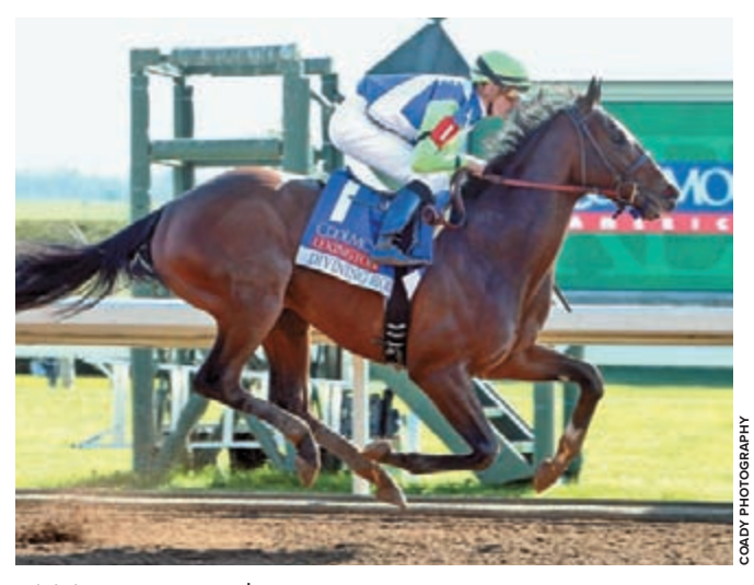
Divining Rod earned $882,604

"His True North (Stakes, G2) in 2016 sold me on the horse," he said. "He was third by a length but he stumbled really badly at the start and they went in 1:08 flat (1:08.18), and I consider that effort to be a grade 1-winning effort all the time.