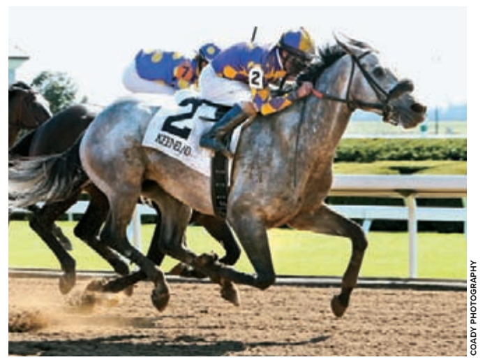
Kobe's Back is a four-time graded stakes winner

Our Josephina, a stakes winner and grade 3-placed, is a granddaughter of Lakeville Miss, champion 2-year-old filly of 1977 and