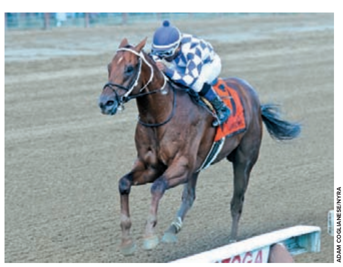
Holy Boss debuts at the new Anchor & Hope Farm in Maryland