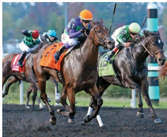
Presque Isle Downs Masters winner Ami's Mesa